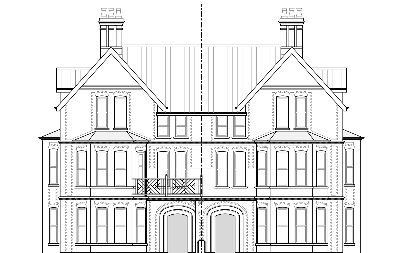
FRONT ELEVATION - SOUTH WEST Scale 1:100