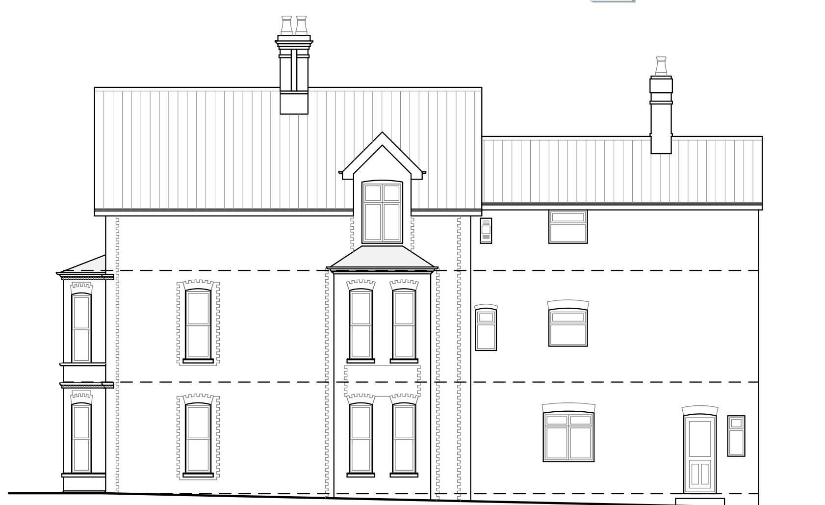
SIDE ELEVATION - SOUTH EAST Scale 1:100