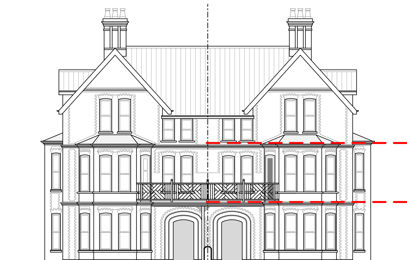
FRONT ELEVATION - SOUTH WEST Scale 1:100