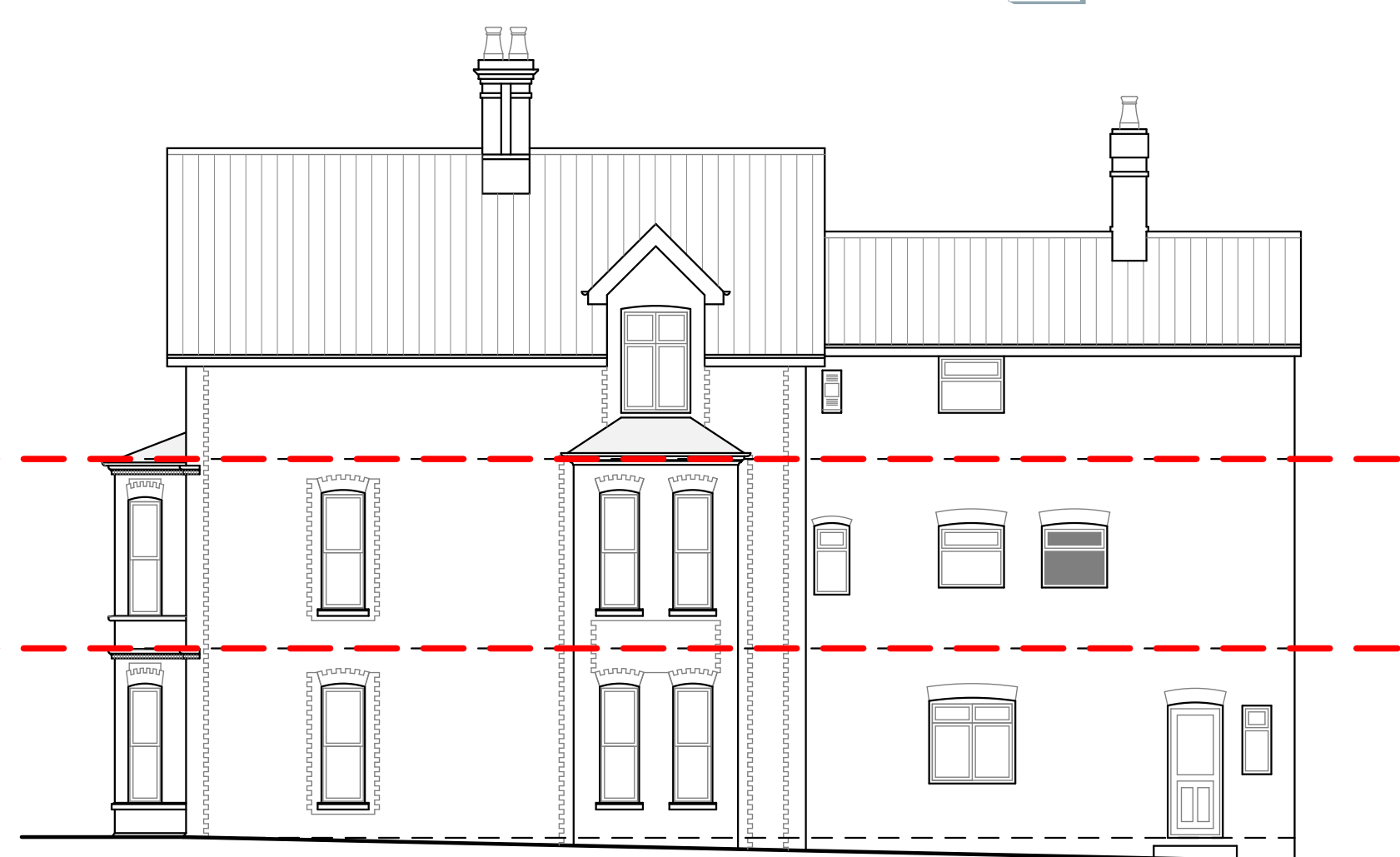
SIDE ELEVATION - SOUTH EAST Scale 1:100

HOWES DESIGNS The Granary Park Farm Aylmerton Norfolk NR11 8PT