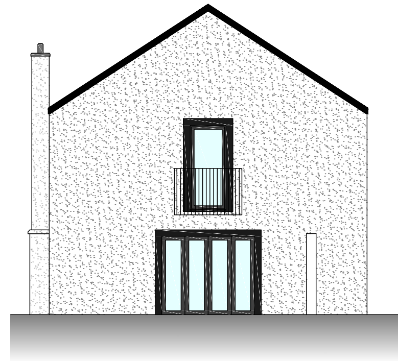
Gable (South) Elevation as Existing 1:100 @ A3