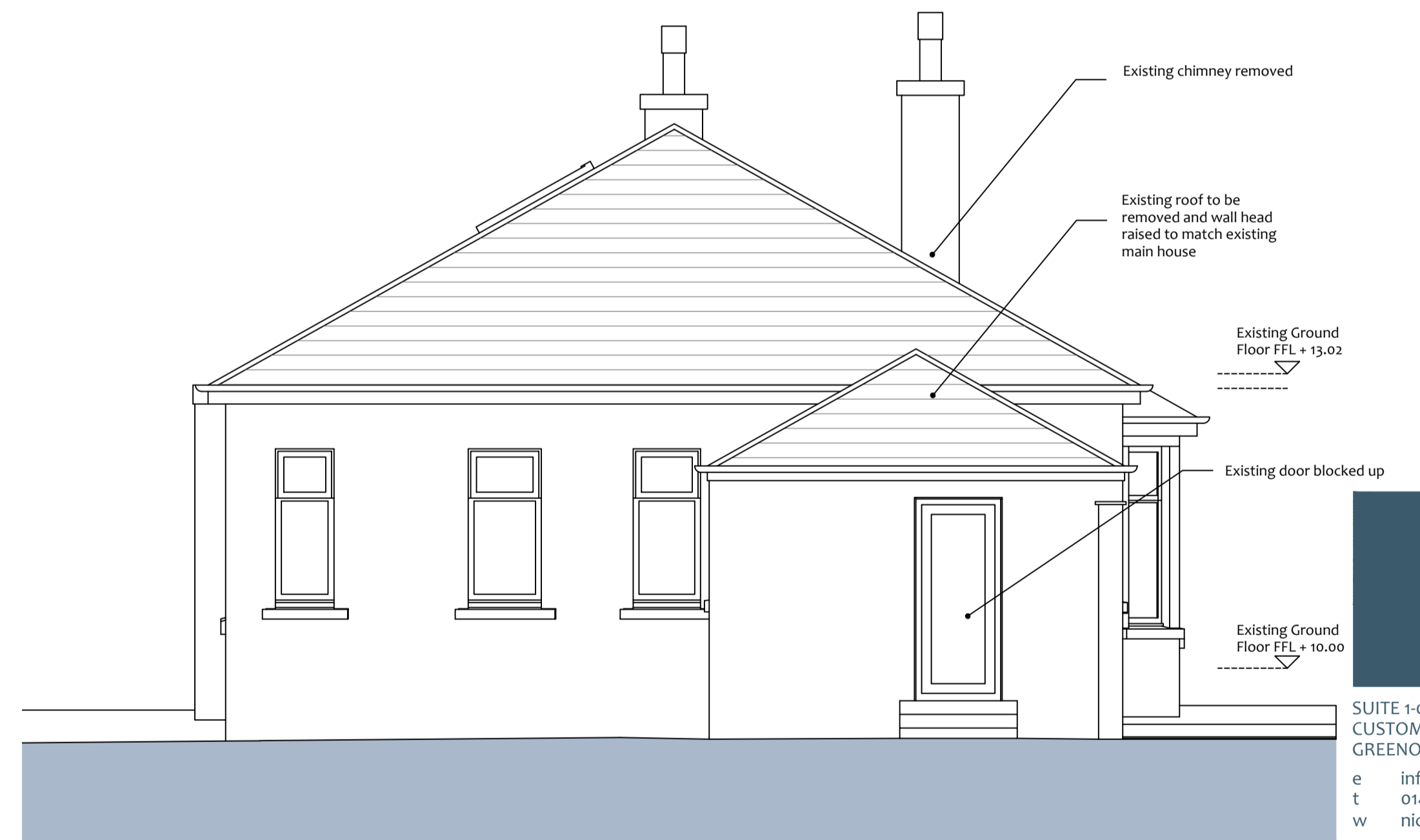
Existing side elevation Scale 1:50