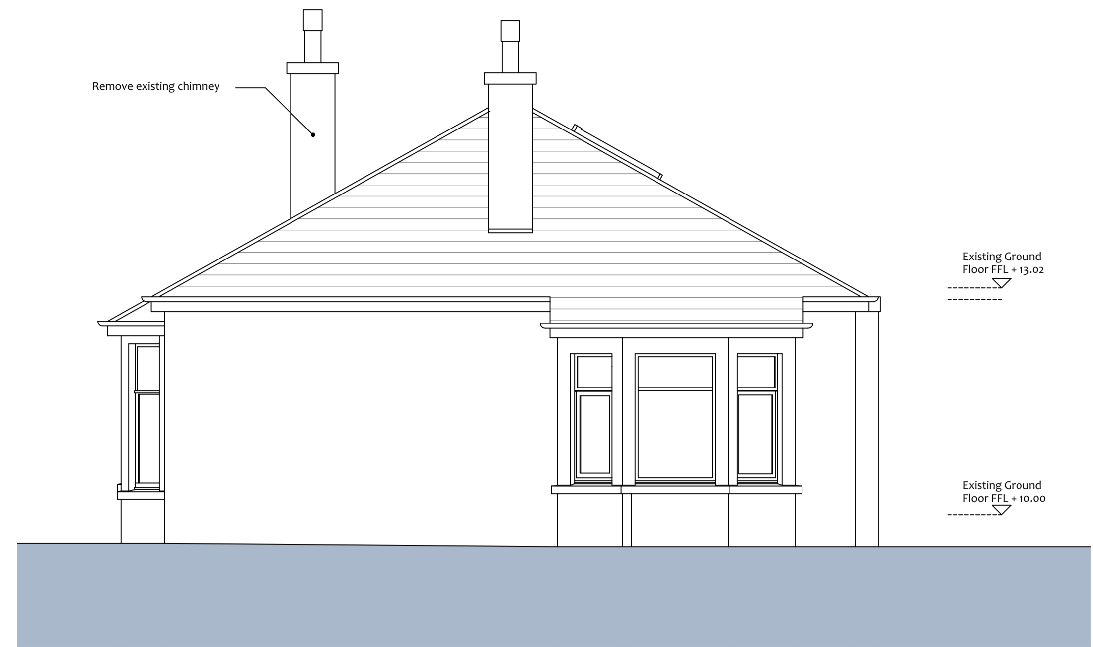
Existing side elevation Scale 1:50