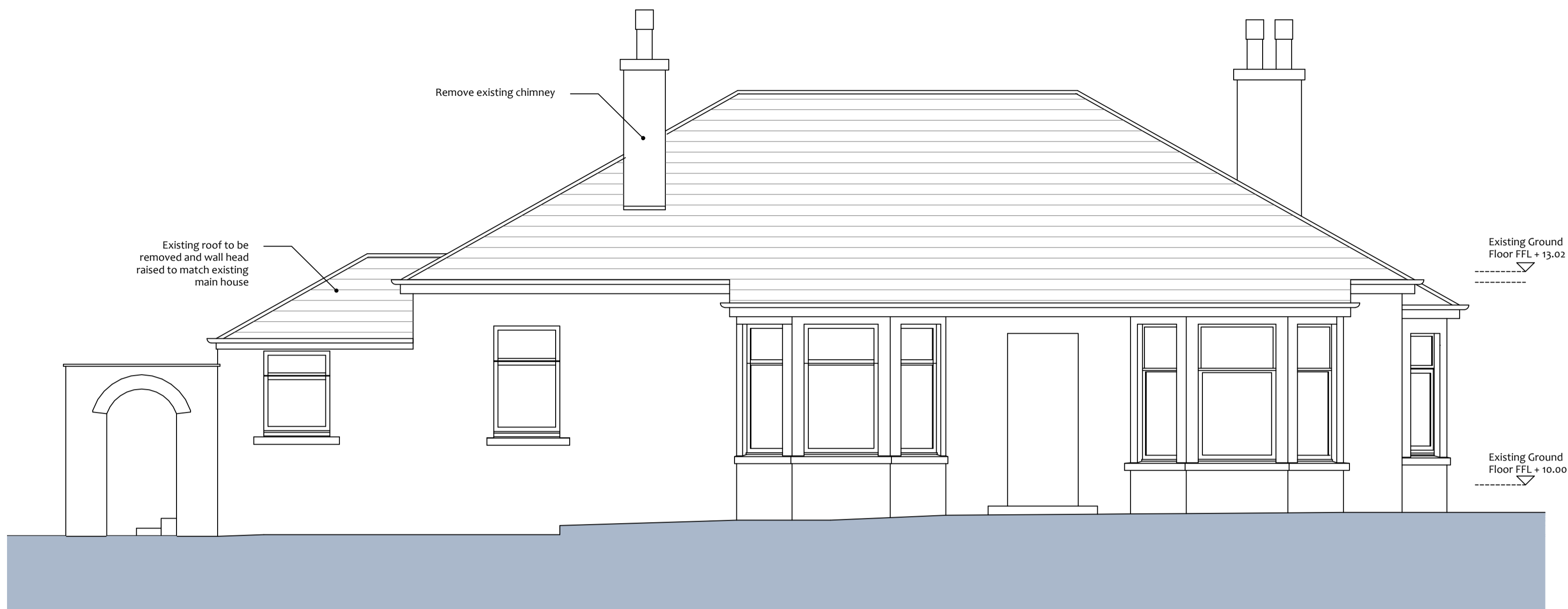
Existing front elevation Scale 1:50