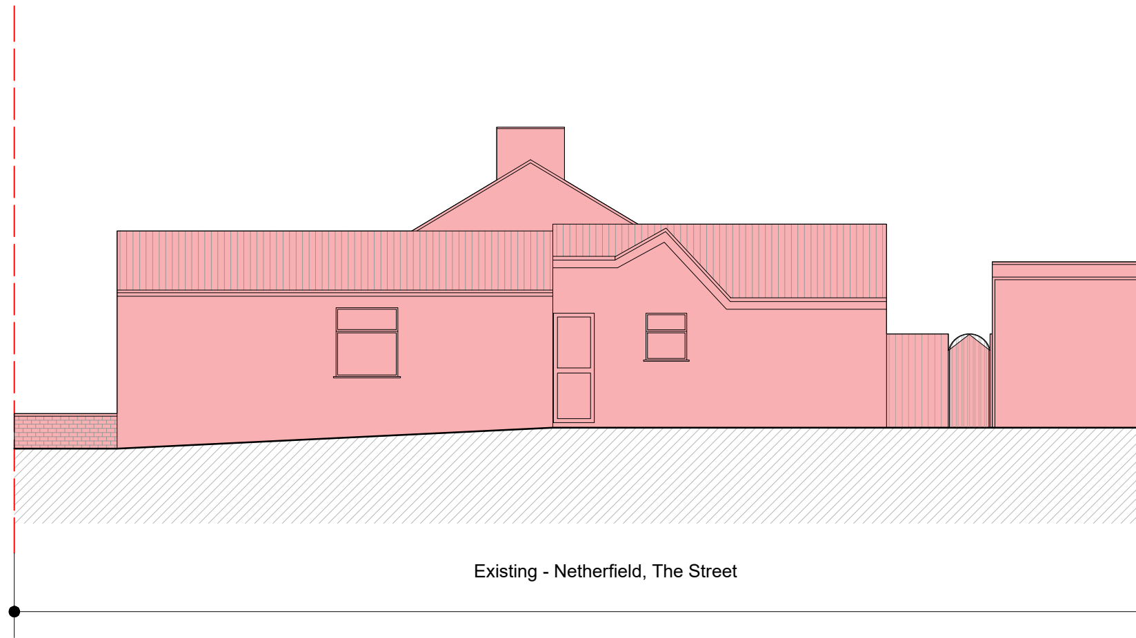
Existing - Netherfield, The Street