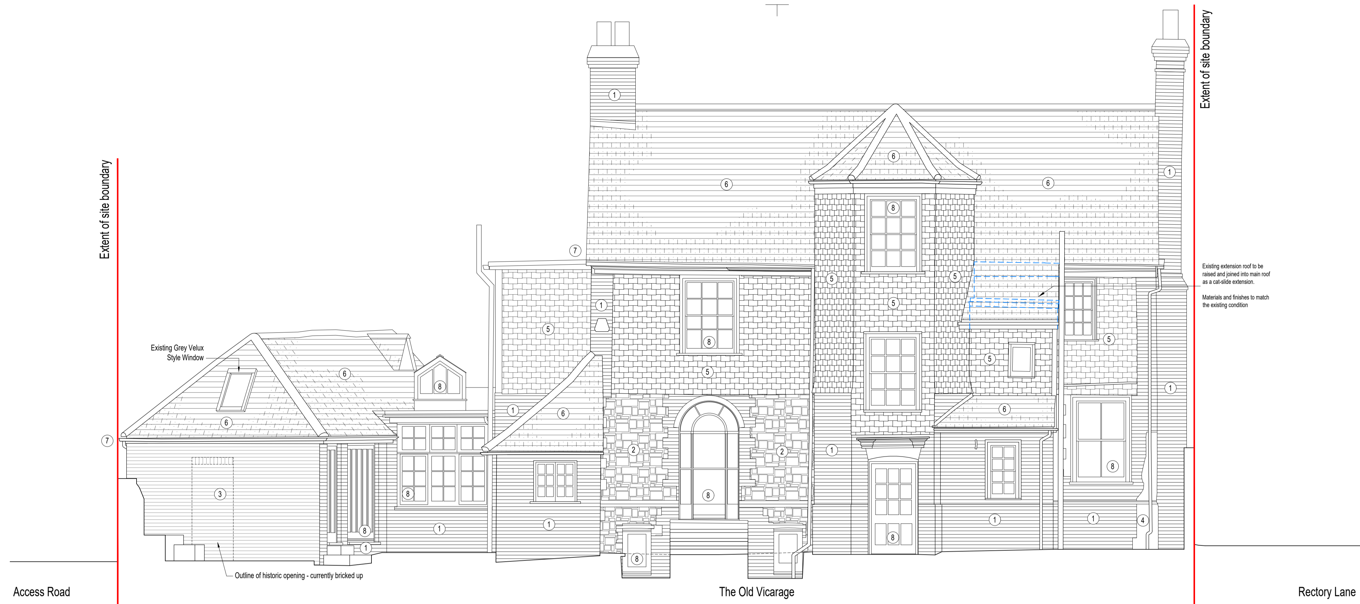
1 ELEVATION Proposed Rear Elevation SCALE 1: 50

DO NOT SCALE FROM THIS DRAWING. Except for planning purposes. All dimensions must be verified by the main contractor before the commencement on site of any item of work or the preparation of shop drawings for their own work or that of sub-contractor or suppliers. This drawing is to be read in conjunction with all relevant documents. Any queries or discrepancies must be reported immediately to the architect. This document is copyright of Studio Hudson Ltd