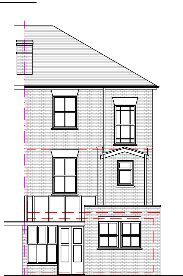
Existing Rear (East) Elevation