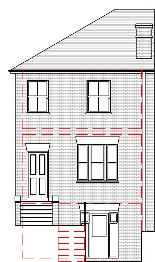
Existing Front (West) Elevation