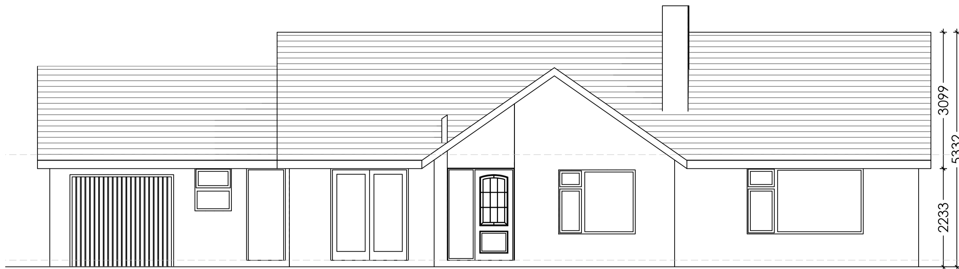
Existing Front Elevation At 1:50 Scale