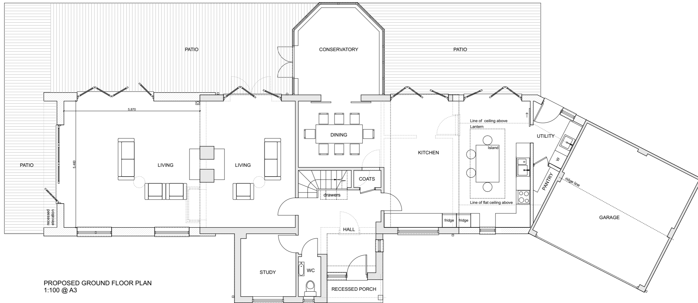
PROPOSED GROUND FLOOR PLAN 1:100 @ A3