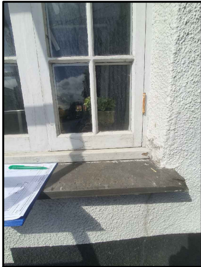
(Sb) PHOTOGRAPHY SHOWING TYPICAL DESIGN - TAKEN JULY 2021 NTS @ A3