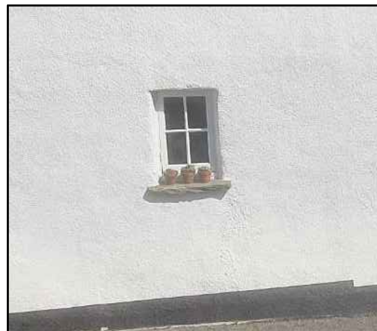
13 SITE PHOTOGRAPHY (JULY 2021) OF GENERAL WINDOW DESIGN STYLES AS EXISTING 1:50 @ A3