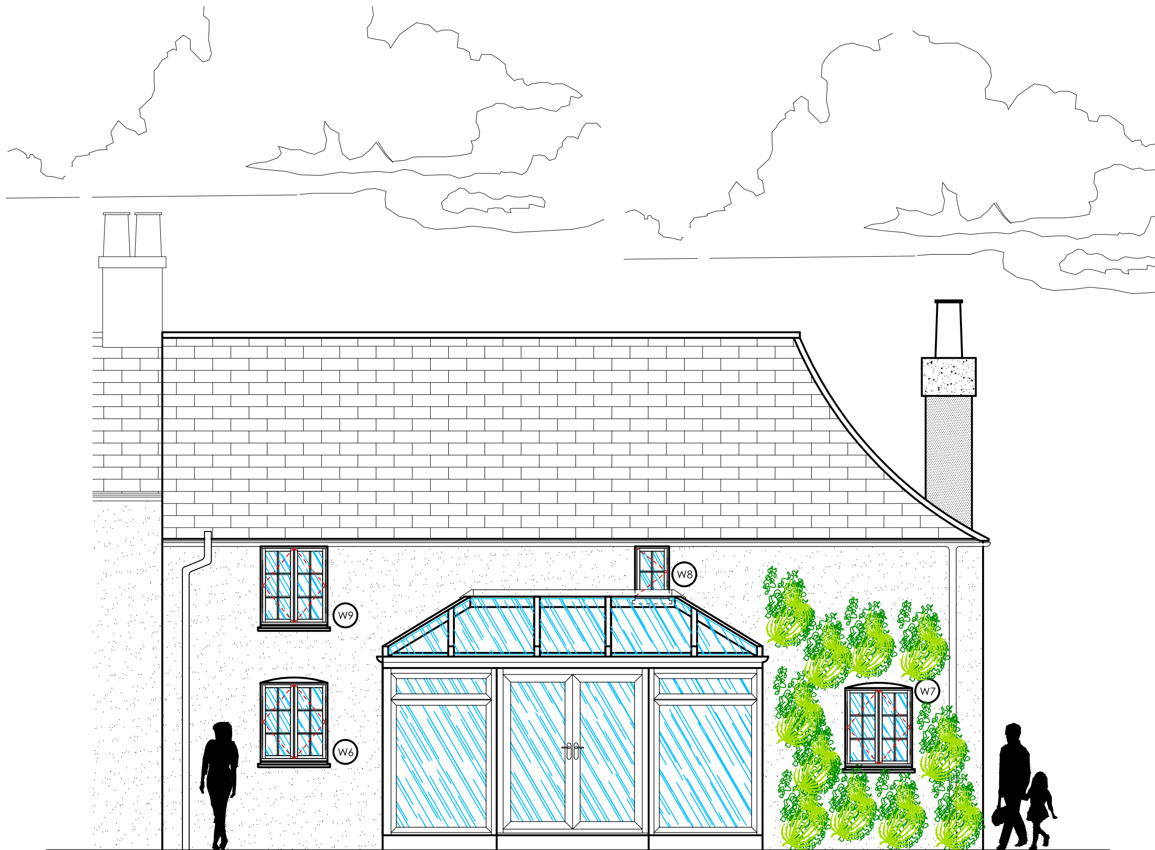
10 REAR (WEST FACING) ELEVATION AS PROPOSED 1:50 @ A3