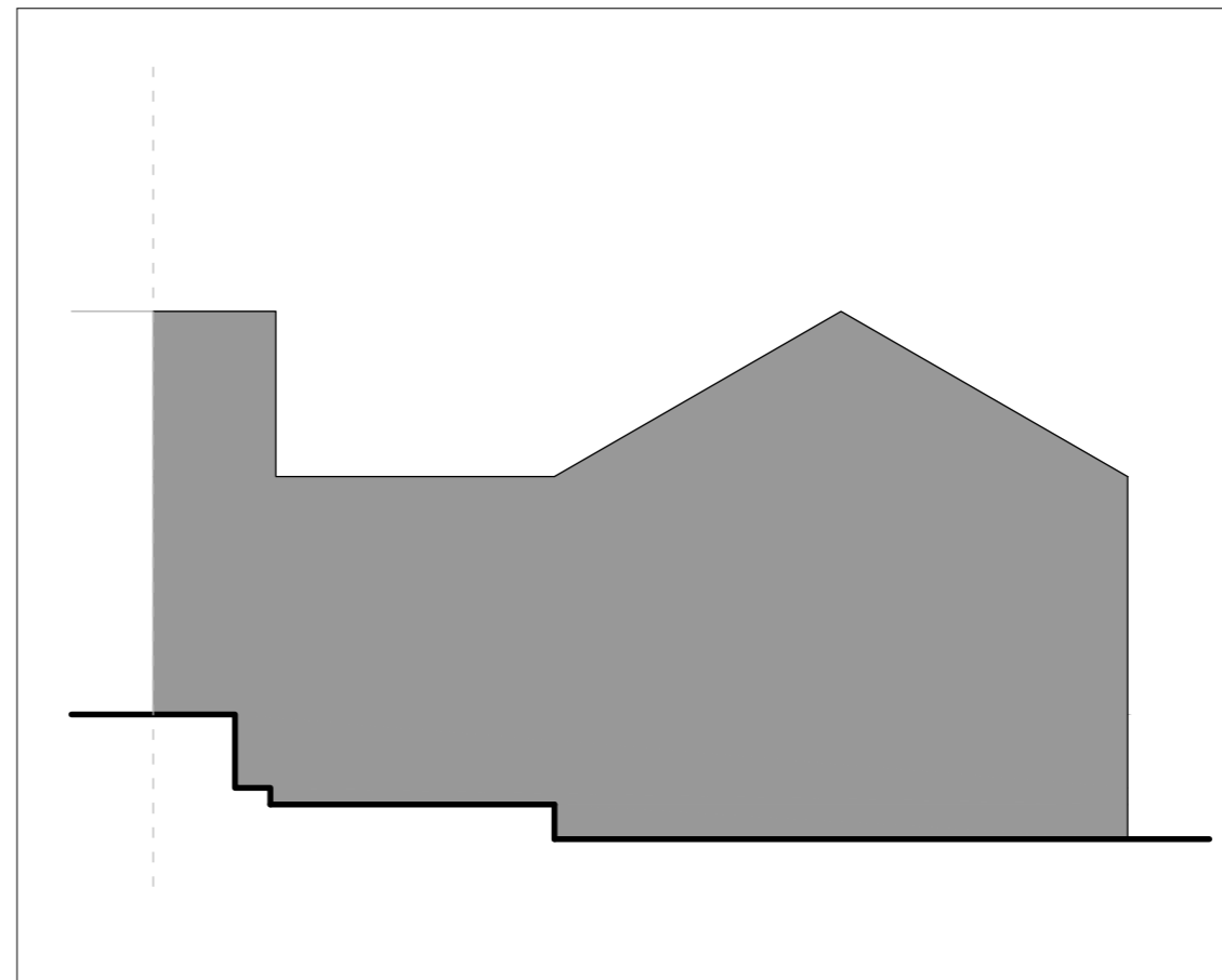
04 PROPOSED SOUTH WEST ELEVATION 1:100