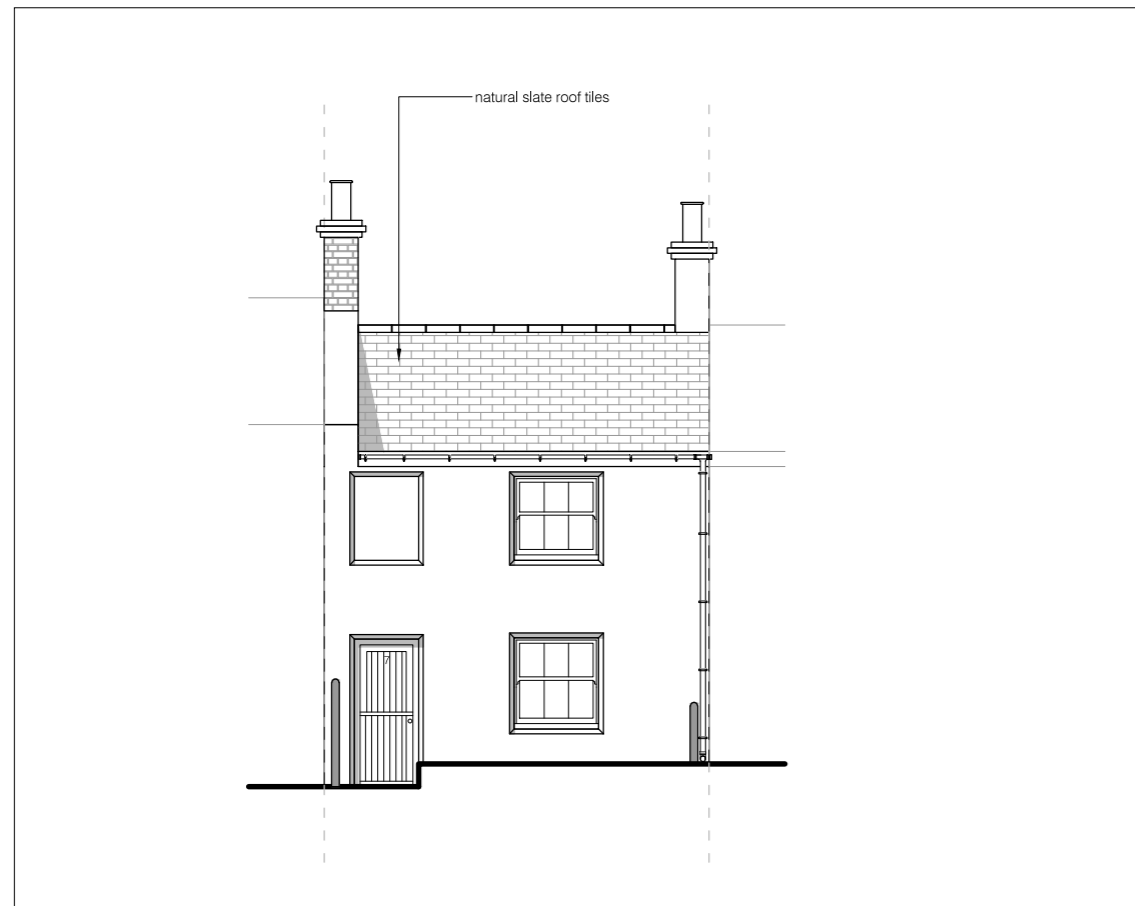
03 PROPOSED SOUTH EAST ELEVATION 1:100