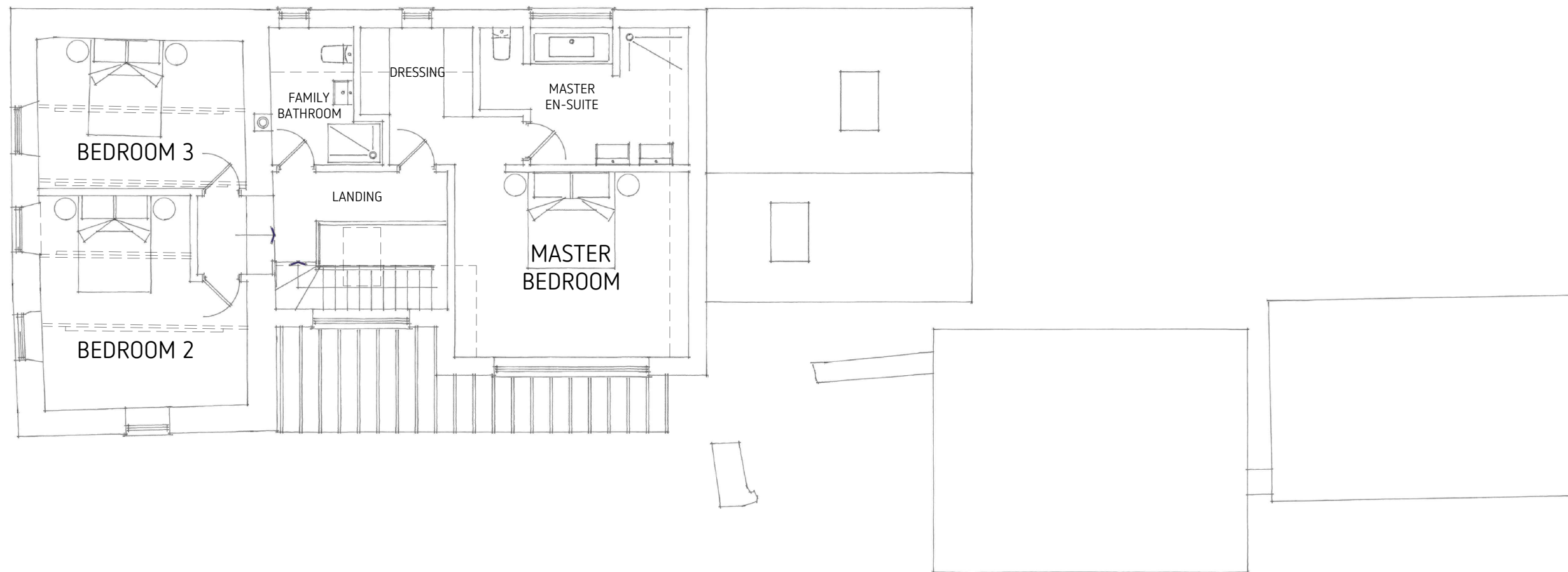
HOUSE FIRST FLOOR & HOME OFFICE ROOF PLAN

Oak Barn layout updated. Addition of roof lights.