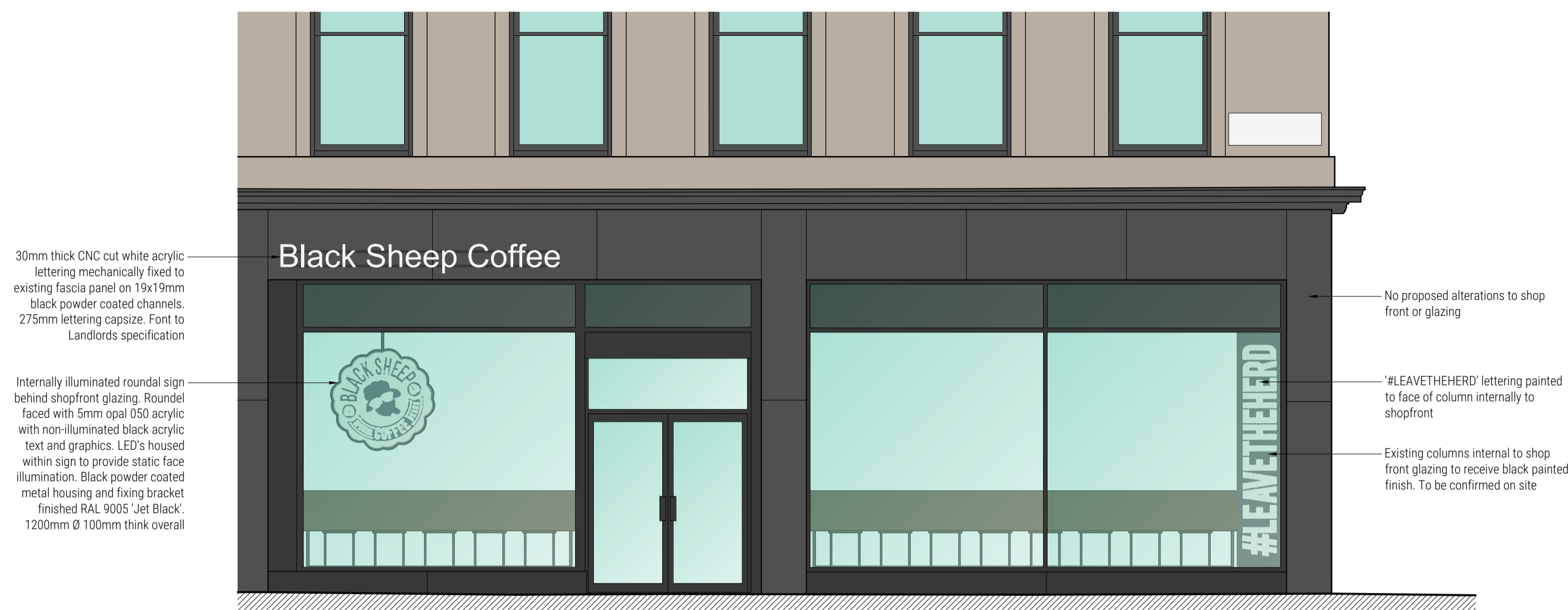
Proposed Sauchiehall Street Elevation