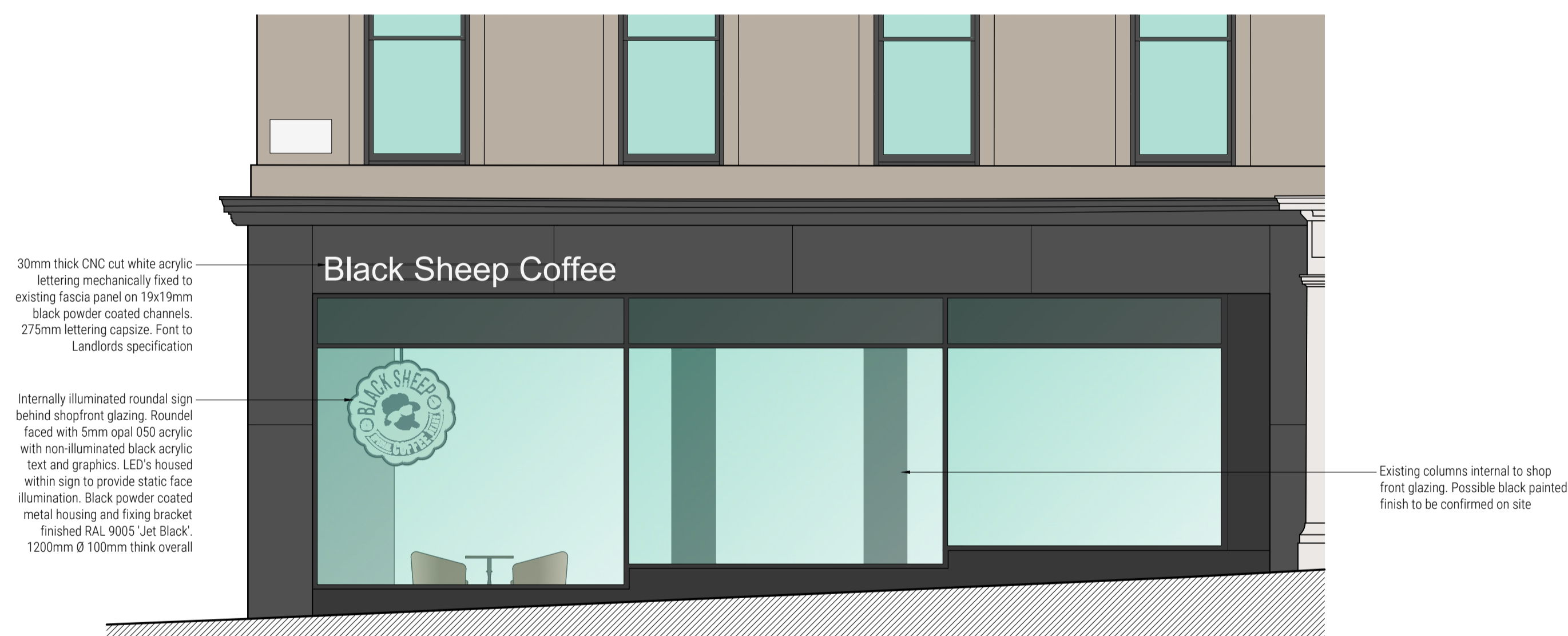
Proposed Rose Street Elevation