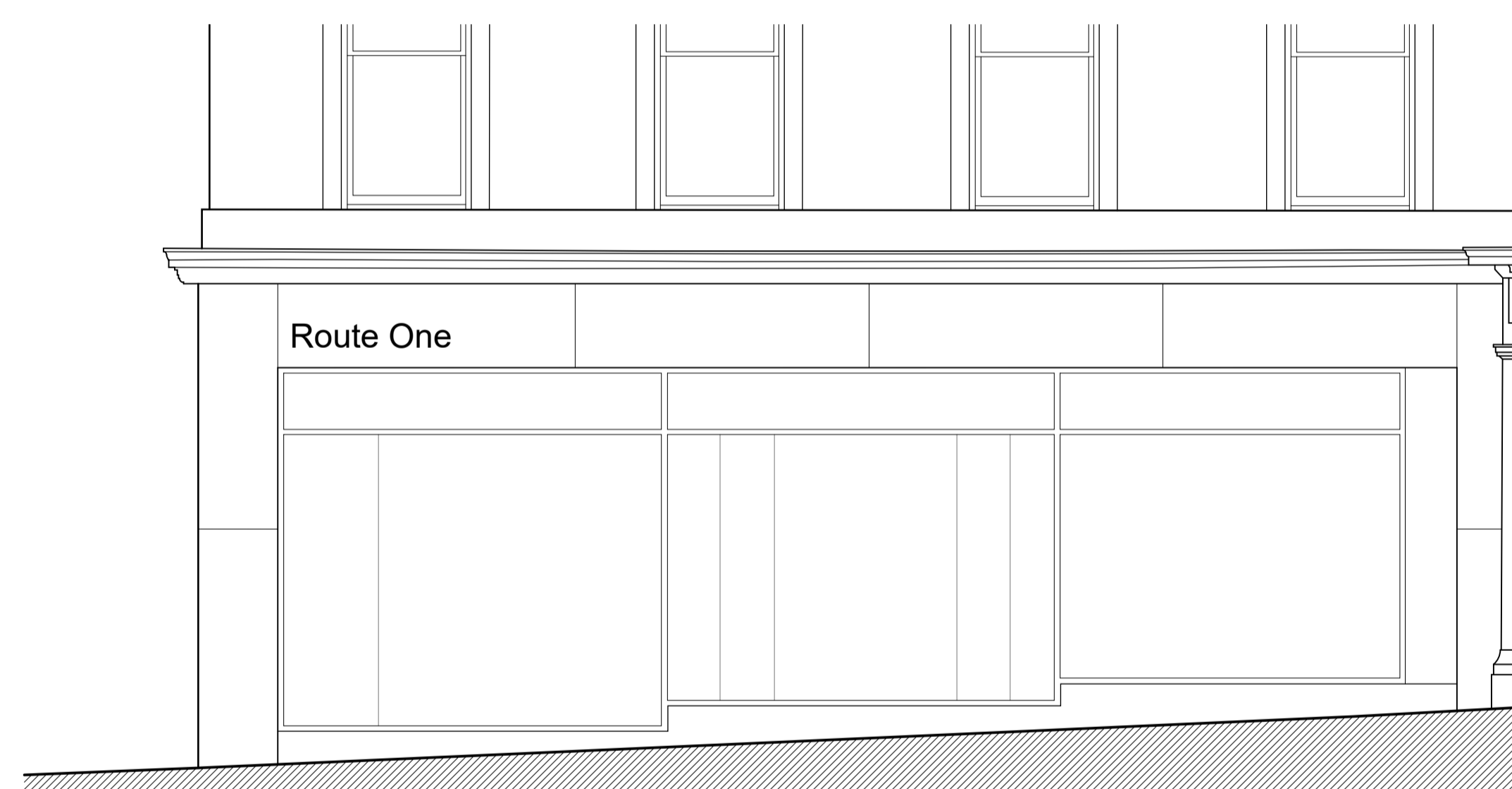
Existing Rose Street Elevation