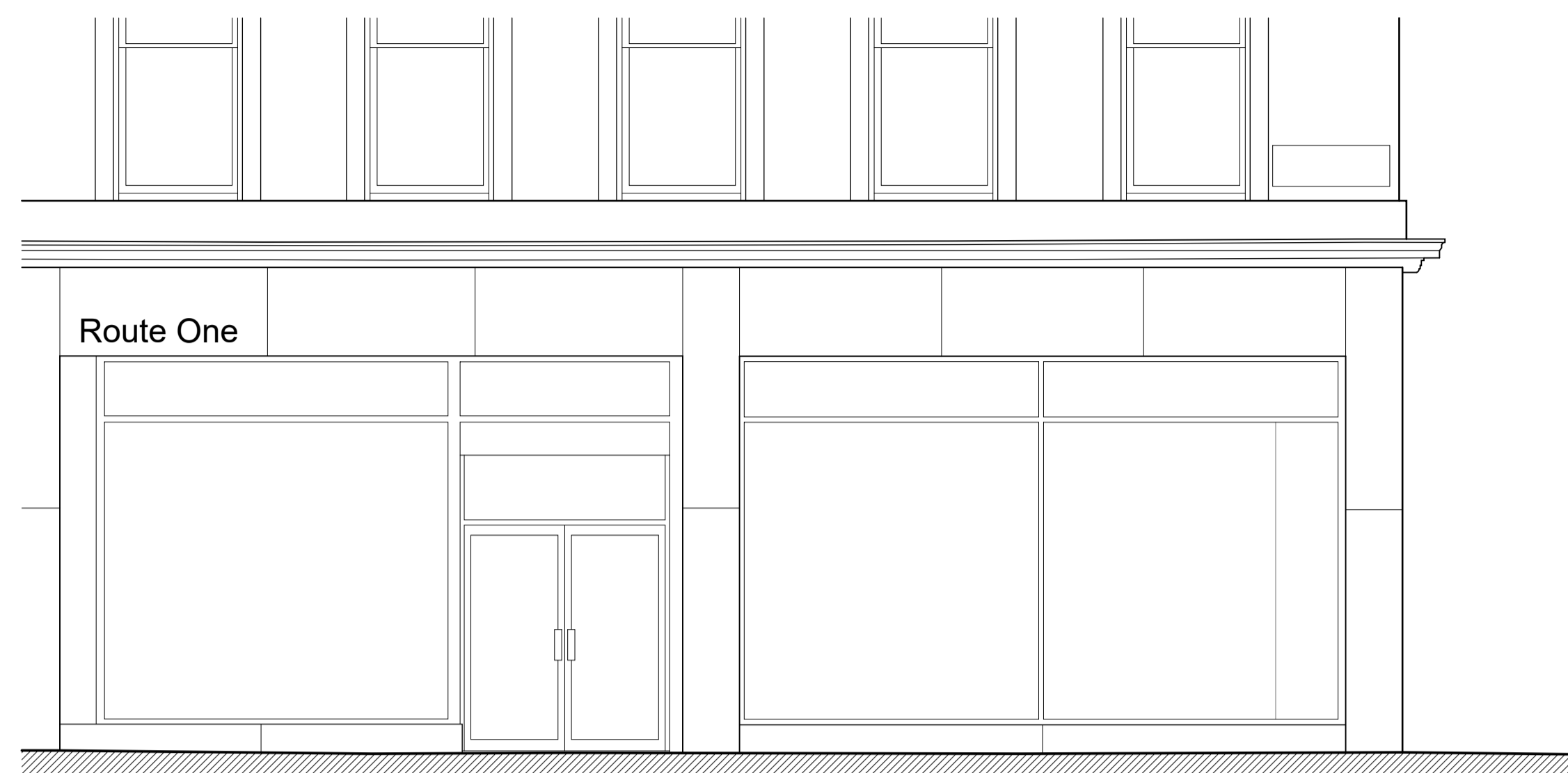
Existing Sauchiehall Street Elevation