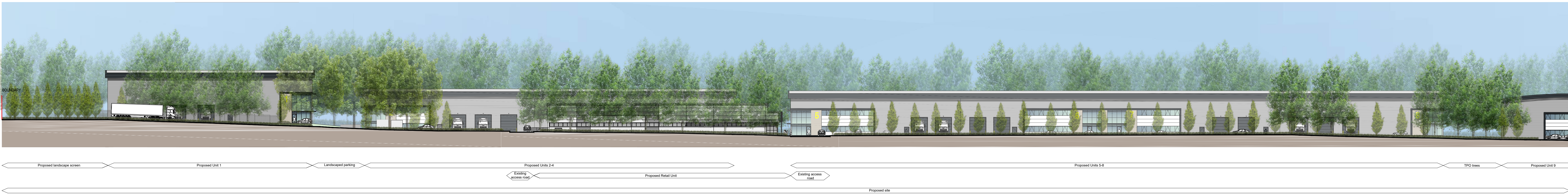
SECTION D-D ALONG BARTLEY WAY