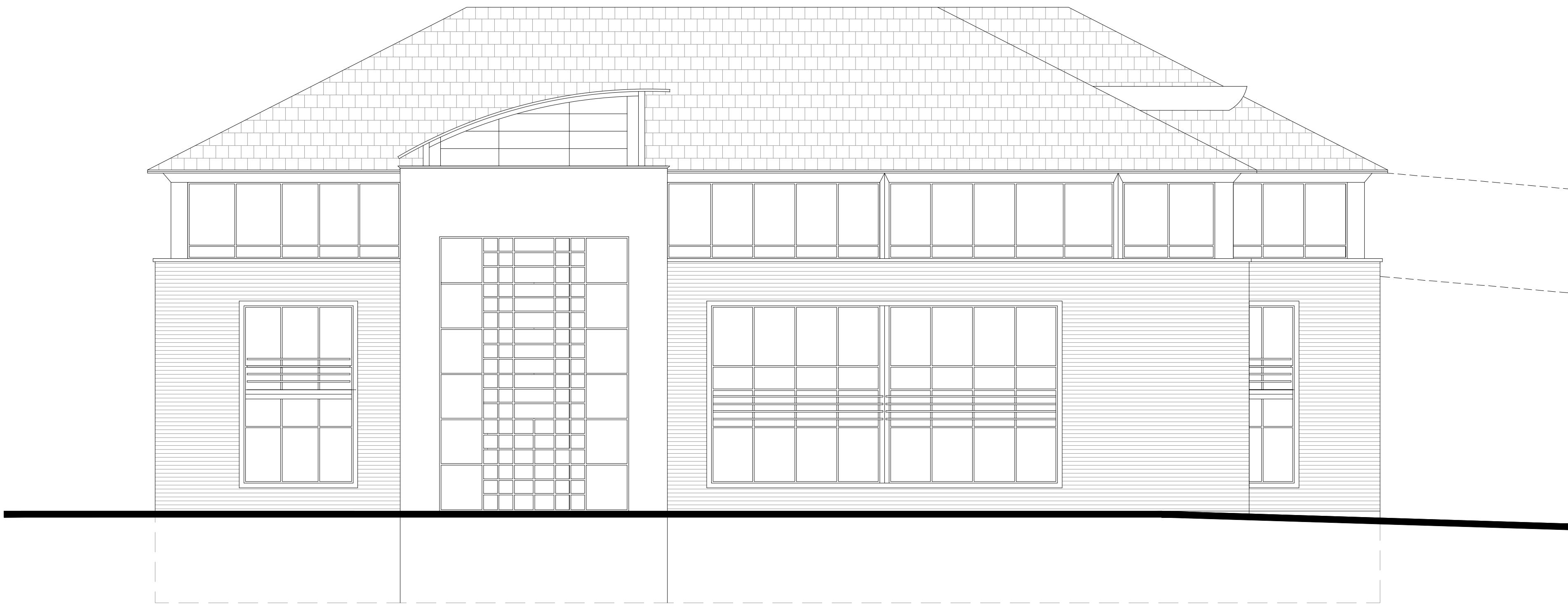
BUILDING 260 - ELEVATION B