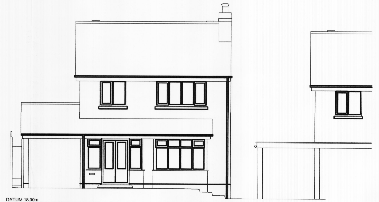
OUTLINE FRONT ELEVATION