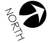
ROOF PLAN AS EXISTING

DO NOT SCALE FROM DRAWING (Except for Town Planning purposes) This drawing is the copyright of JON BUTCHER ARCHITECT All dimensions are to be checked on site and any discrepancies reported to the project Architect. Unless otherwise stated dimensions are taken to structural elements. All foundation work shown is provisional and subject to on site approval by the Local Authority.