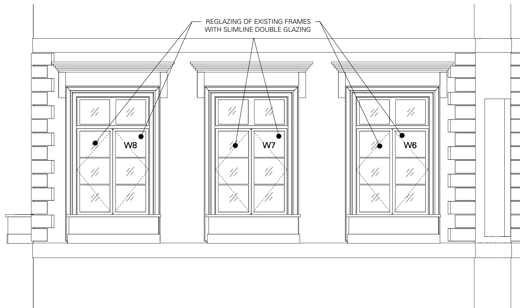
1 PROPOSED SOUTH ELEVATION 1 : 50

This drawing has been produced for the below named Client for the development of the below named Project and for that application alone and is not intended for use by any other person or for any other purpose. Drawings remain copyright of RAFT and may not be reproduced without written consent or licence. Do not scale off this drawing. All dimensions and levels to be checked on site or measured survey before starting work. Any discrepancies to be reported to architects before execution of relevant works. Read with other drawings and specification.