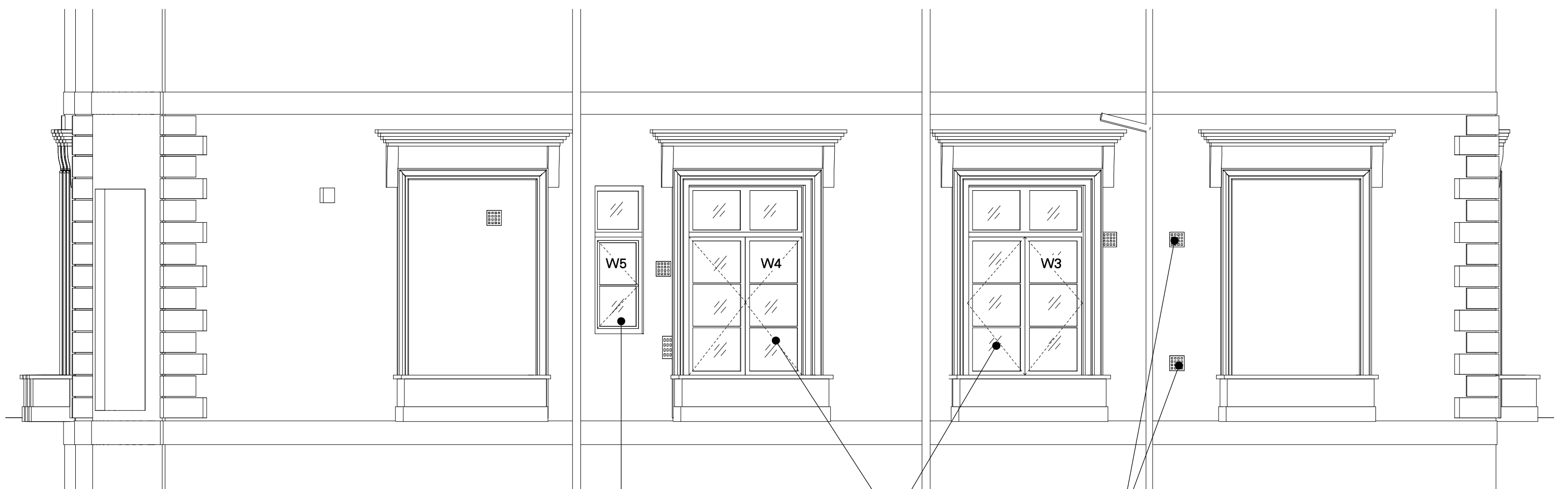
3 PROPOSED NORTHEAST ELEVATION 1 : 50