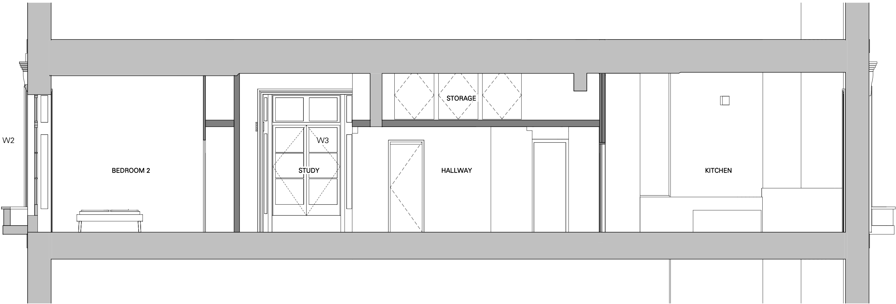
AA' PROPOSED SECTION AA' 1 : 50

This drawing has been produced for the below named Client for the development of the below named Project and for that application alone and is not intended for use by any other person or for any other purpose. Drawings remain copyright of RAFT and may not be reproduced without written consent or licence. Do not scale off this drawing. All dimensions and levels to be checked on site or measured survey before starting work. Any discrepancies to be reported to architects before execution of relevant works. Read with other drawings and specification.