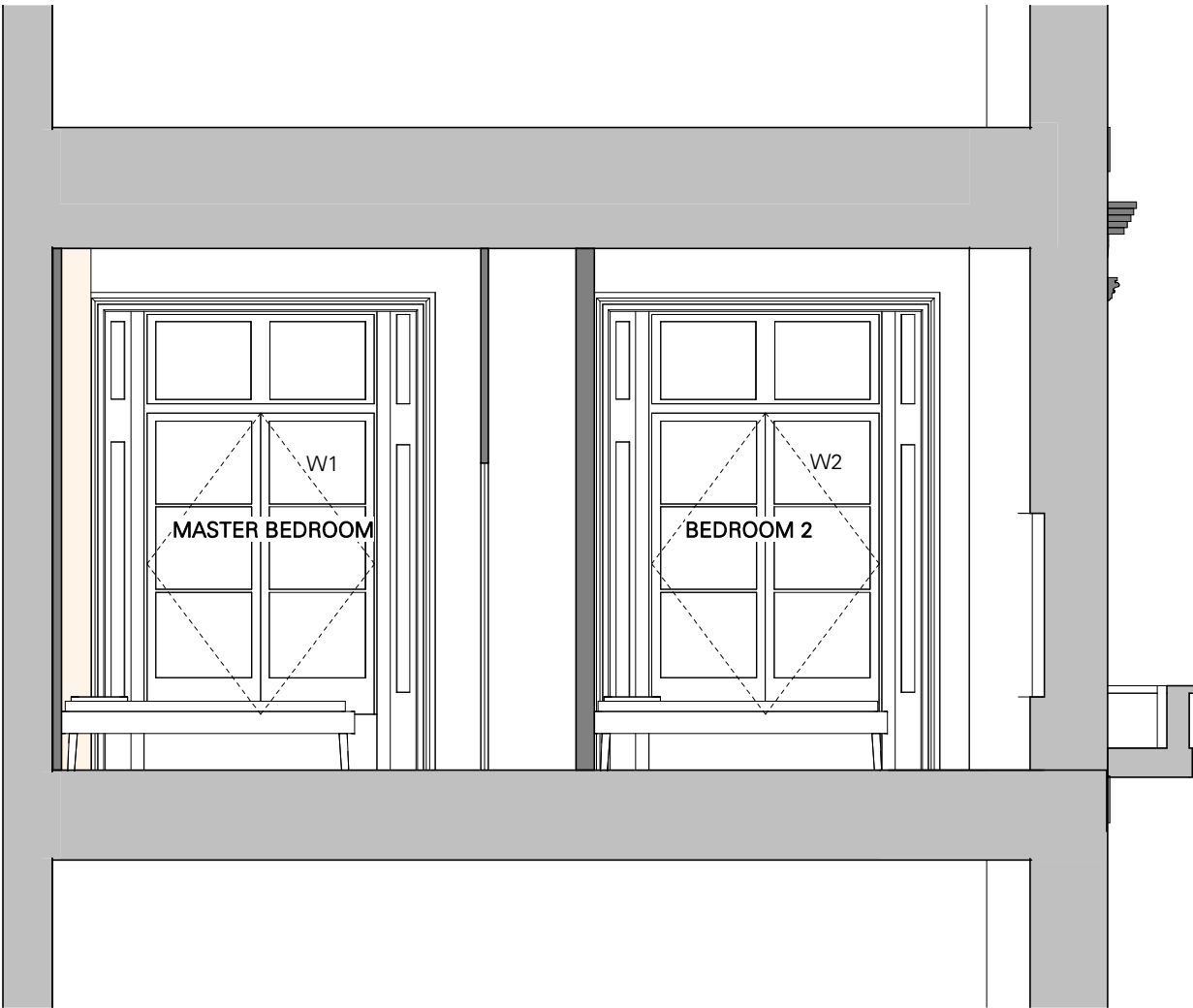
DD' PROPOSED SECTION DD' 1 : 50