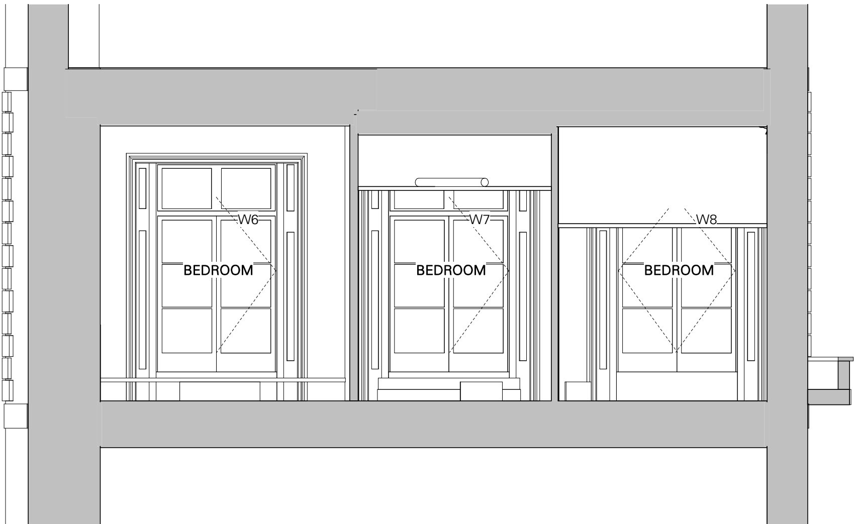
CC' EXISTING SECTION CC' 1 : 50

This drawing has been produced for the below named Client for the development of the below named Project and for that application alone and is not intended for use by any other person or for any other purpose. Drawings remain copyright of RAFT and may not be reproduced without written consent or licence. Do not scale off this drawing. All dimensions and levels to be checked on site or measured survey before starting work. Any discrepancies to be reported to architects before execution of relevant works. Read with other drawings and specification.