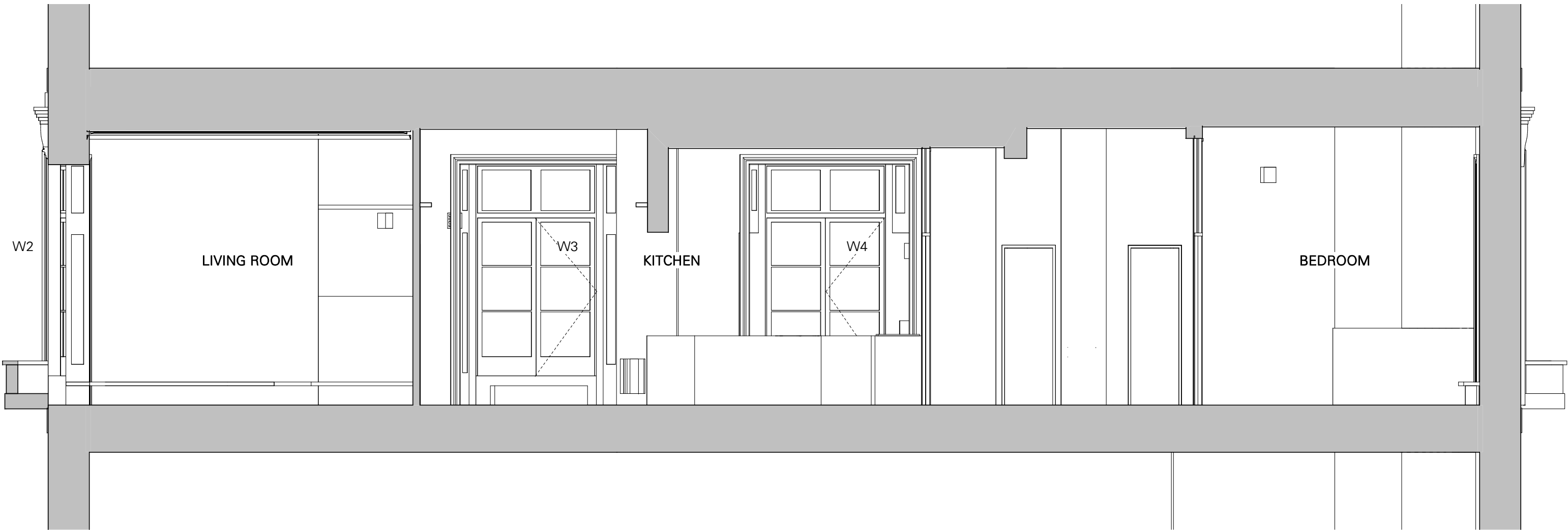
AA' EXISTING SECTION AA' 1 : 50

This drawing has been produced for the below named Client for the development of the below named Project and for that application alone and is not intended for use by any other person or for any other purpose. Drawings remain copyright of RAFT and may not be reproduced without written consent or licence. Do not scale off this drawing. All dimensions and levels to be checked on site or measured survey before starting work. Any discrepancies to be reported to architects before execution of relevant works. Read with other drawings and specification.