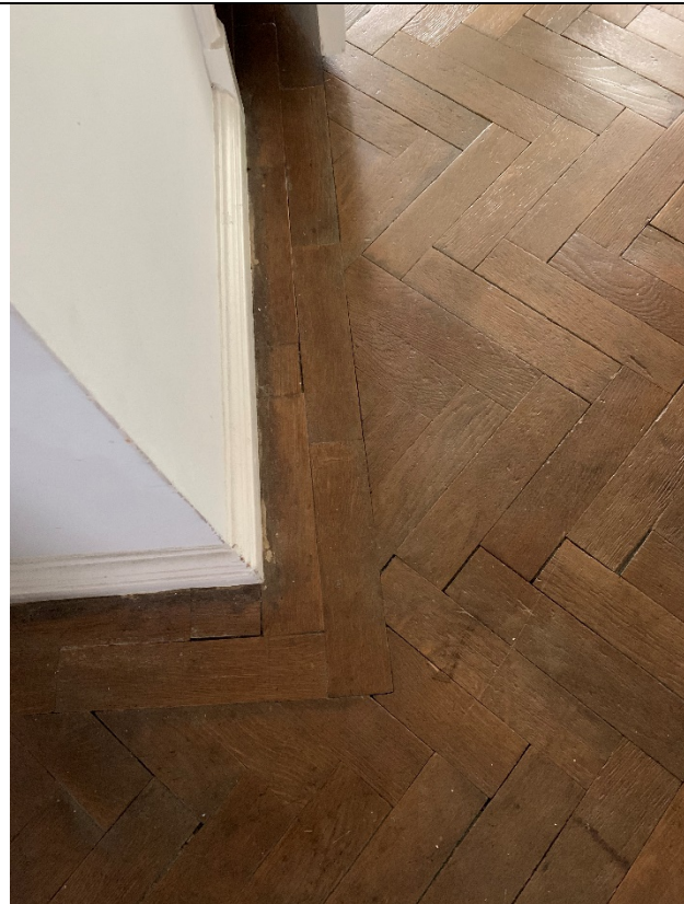
Original parquet flooring