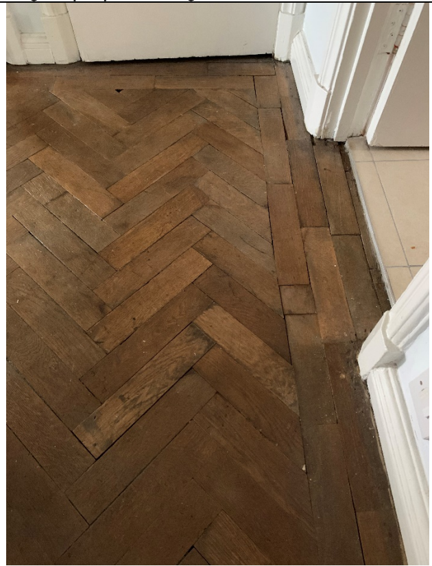
Original parquet flooring