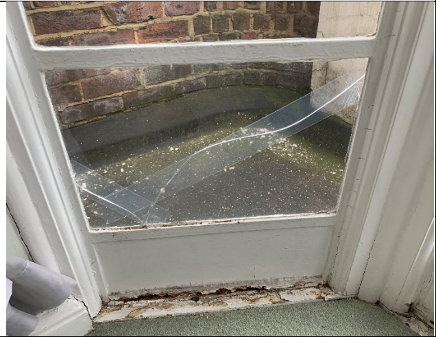
Windows and Balcony