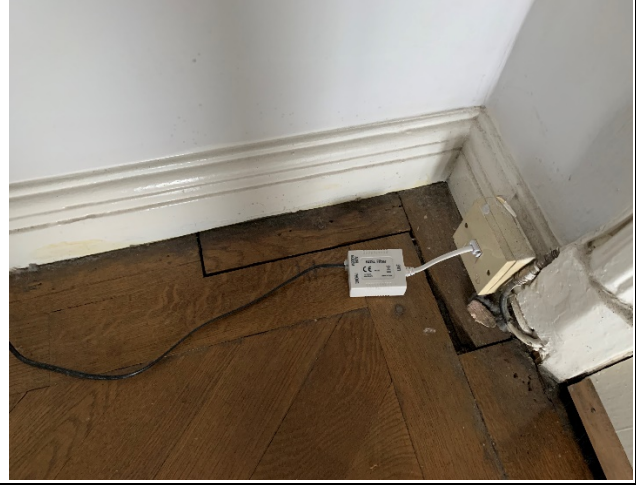
Original parquet flooring