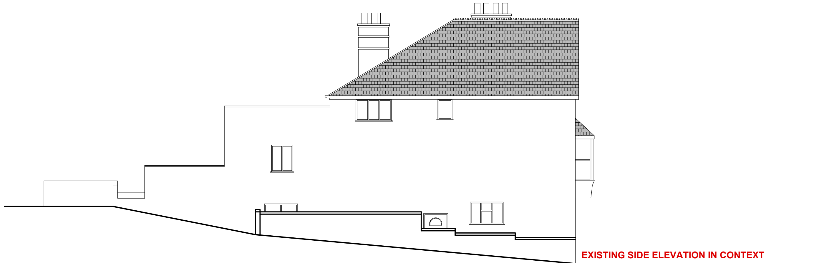
EXISTING SIDE ELEVATION IN CONTEXT

ALL NEW SASH WINDOWS TO BE TIMBER DOUBLE GLAZED COLOUR OF TIMBER FRAMES - WHITE