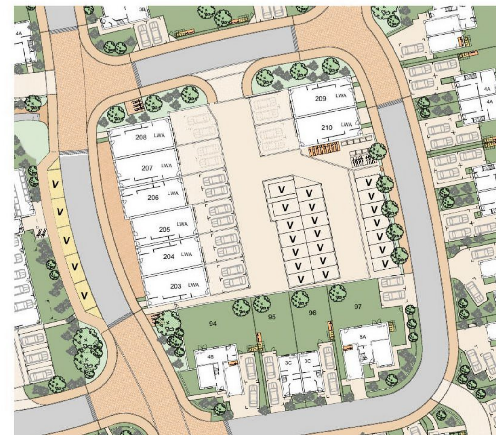
SITE PLAN - COMMERCIAL / LIVE WORK UNITS 1:500