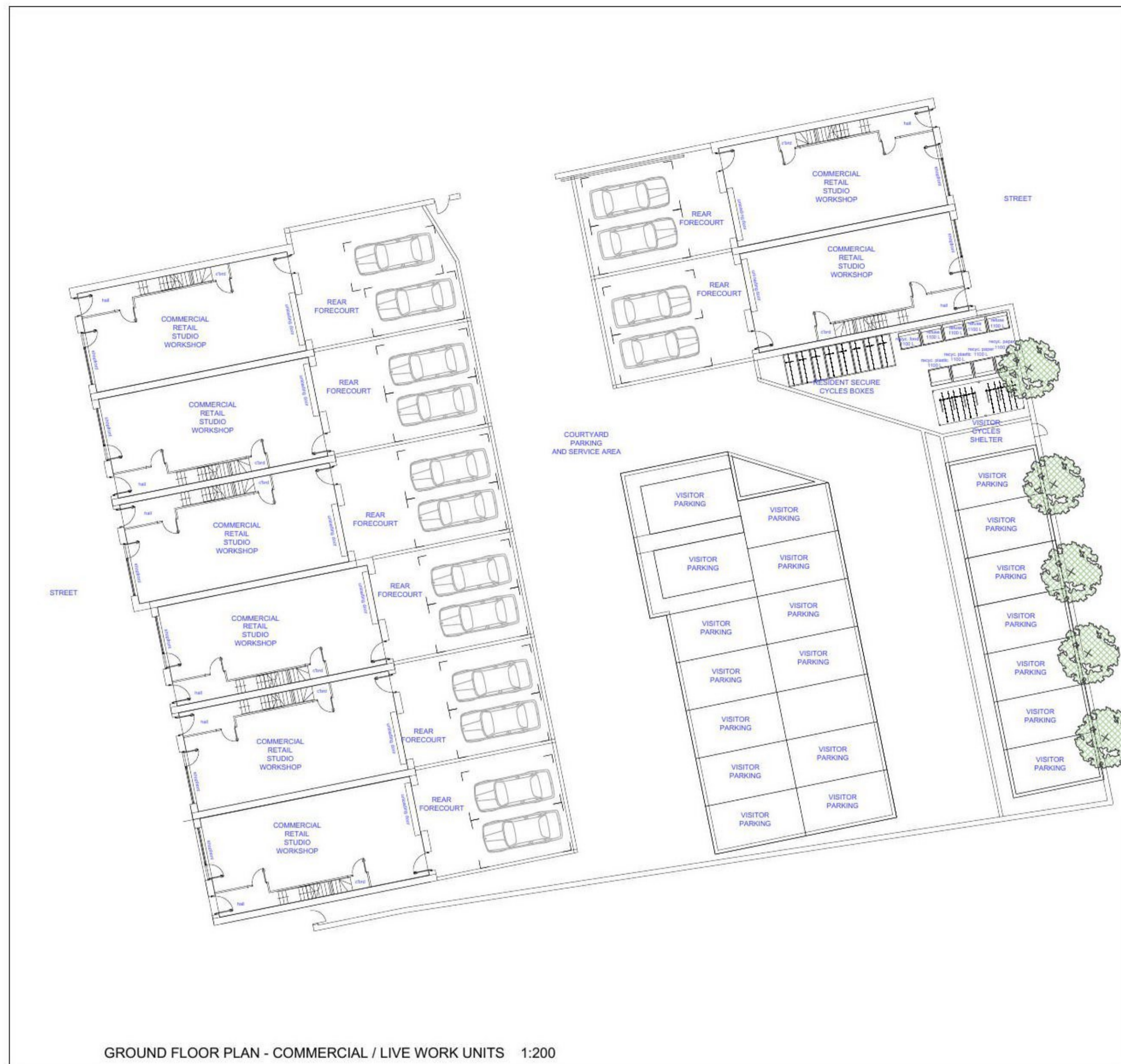
GROUND FLOOR PLAN - COMMERCIAL / LIVE WORK UNITS 1:200