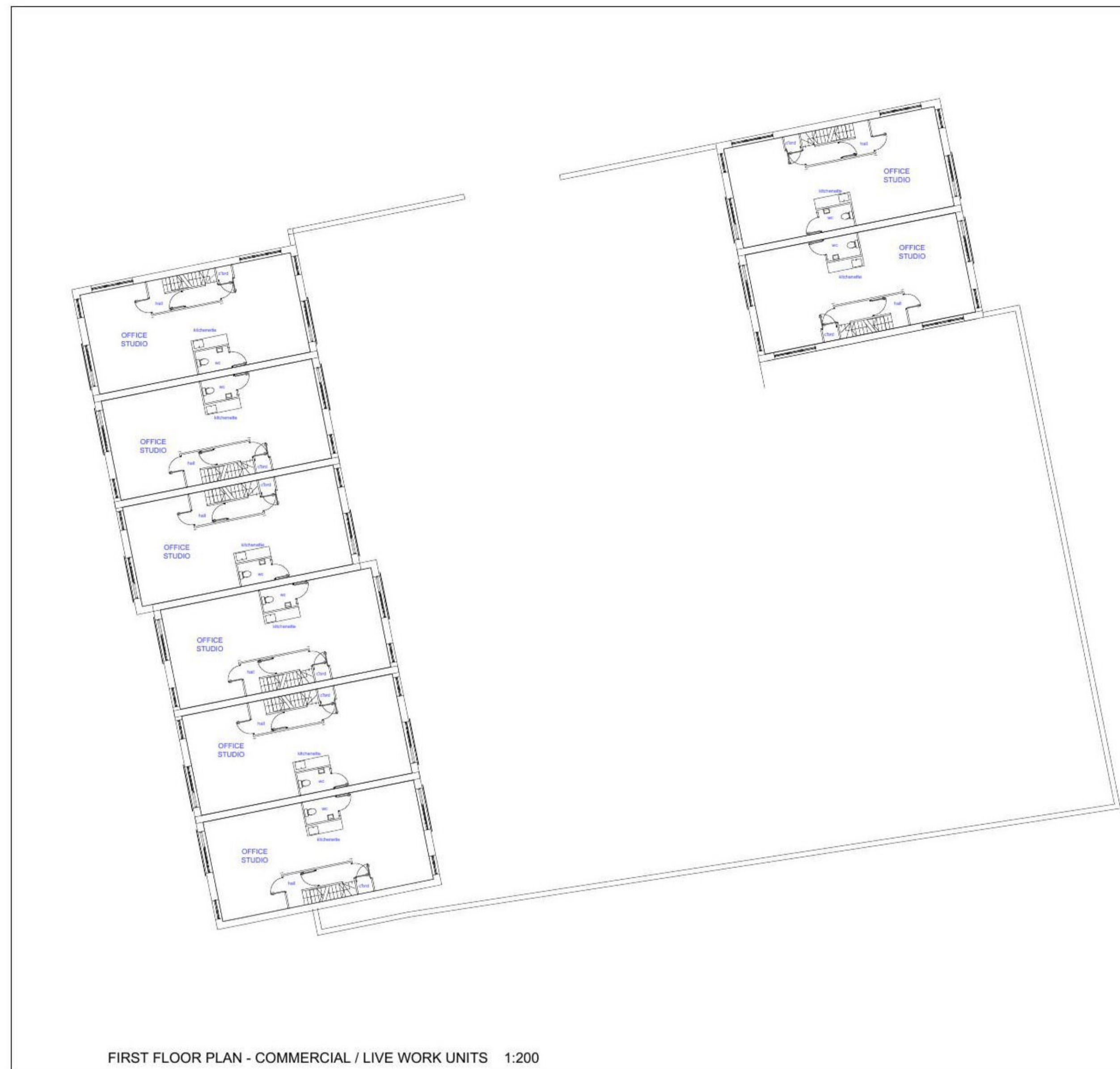
FIRST FLOOR PLAN - COMMERCIAL / LIVE WORK UNITS 1:200