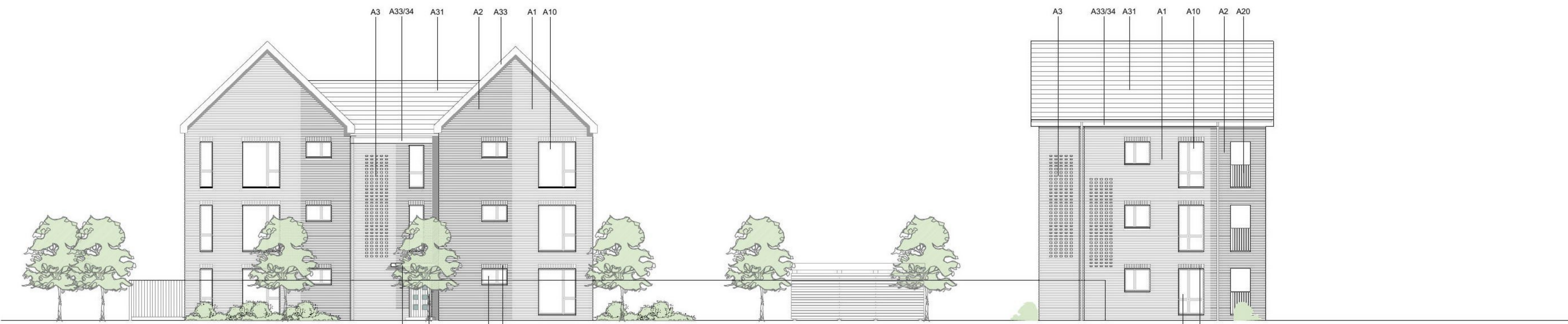
2 - REAR ELEVATION - NORTH - BLOCK D