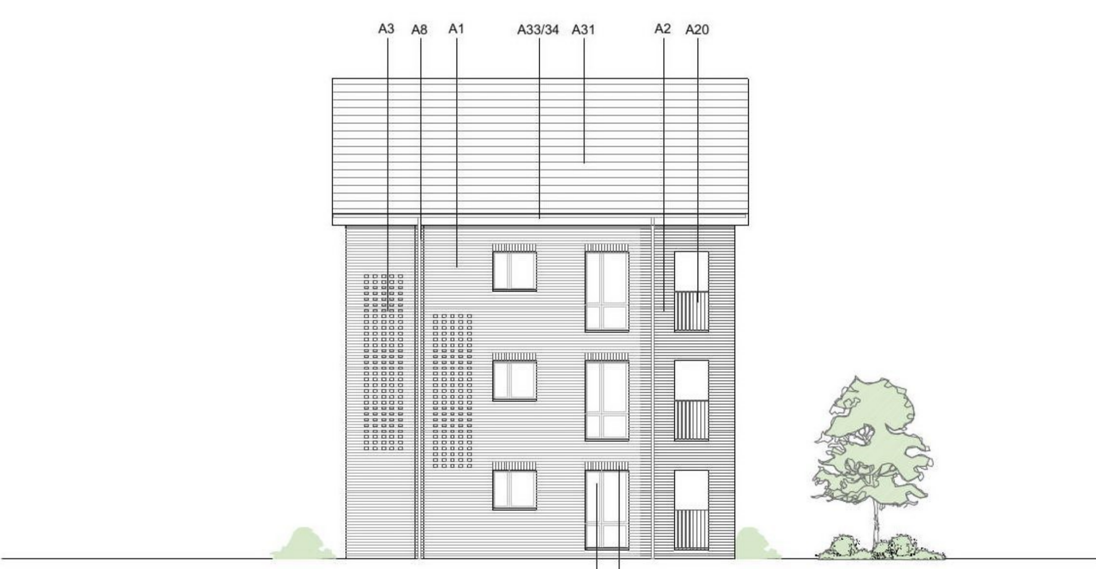
3 - SIDE ELEVATION - WEST - BLOCK D

A updated in line with PI 1000 revN 10.5.21 dt