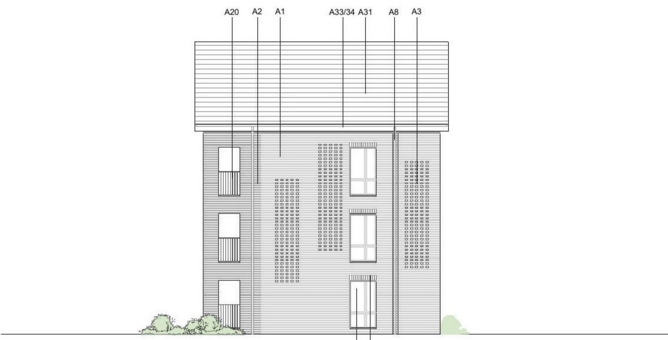
4 - SIDE ELEVATION - EAST - BLOCK D