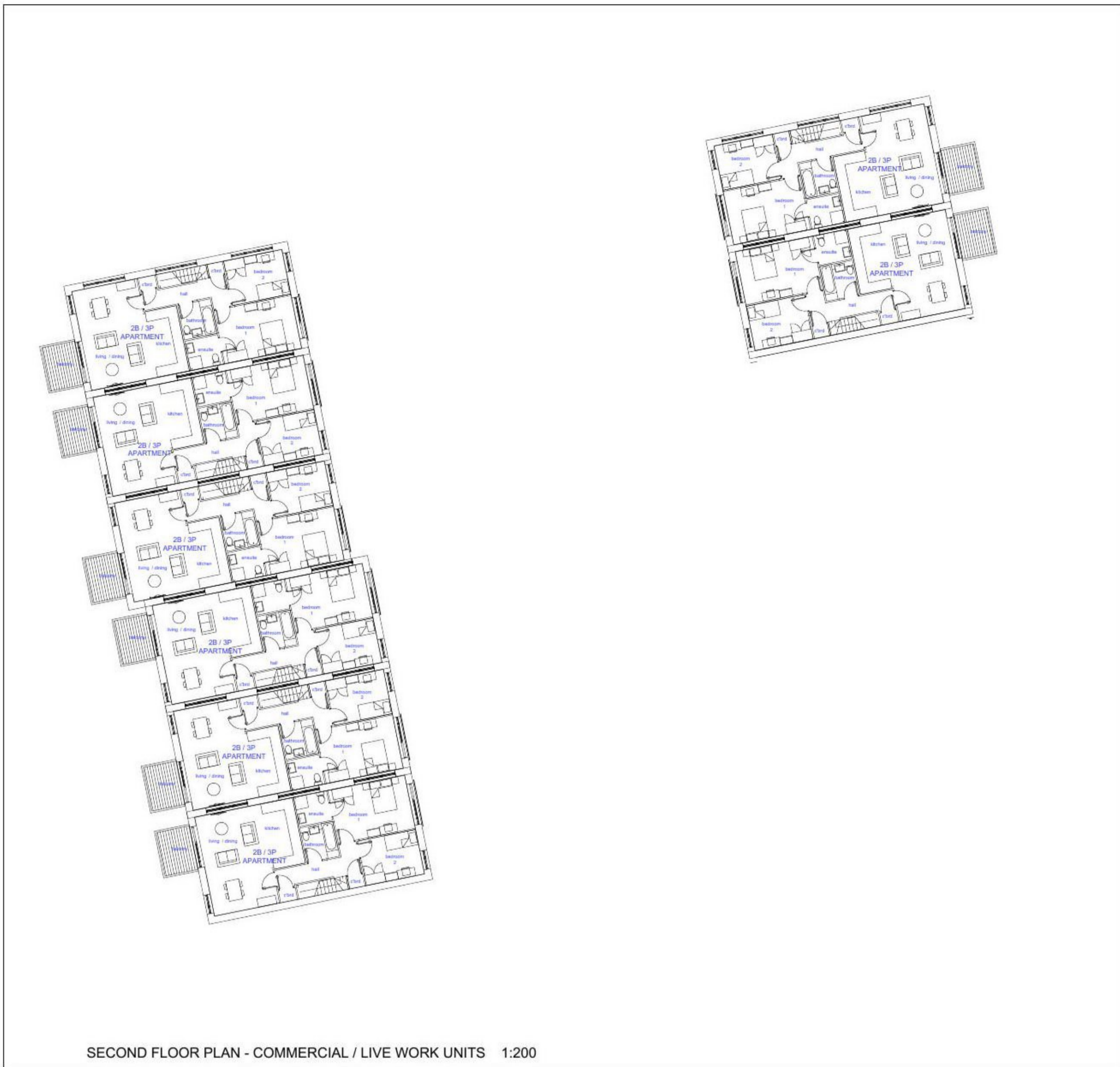
SECOND FLOOR PLAN - COMMERCIAL / LIVE WORK UNITS 1:200