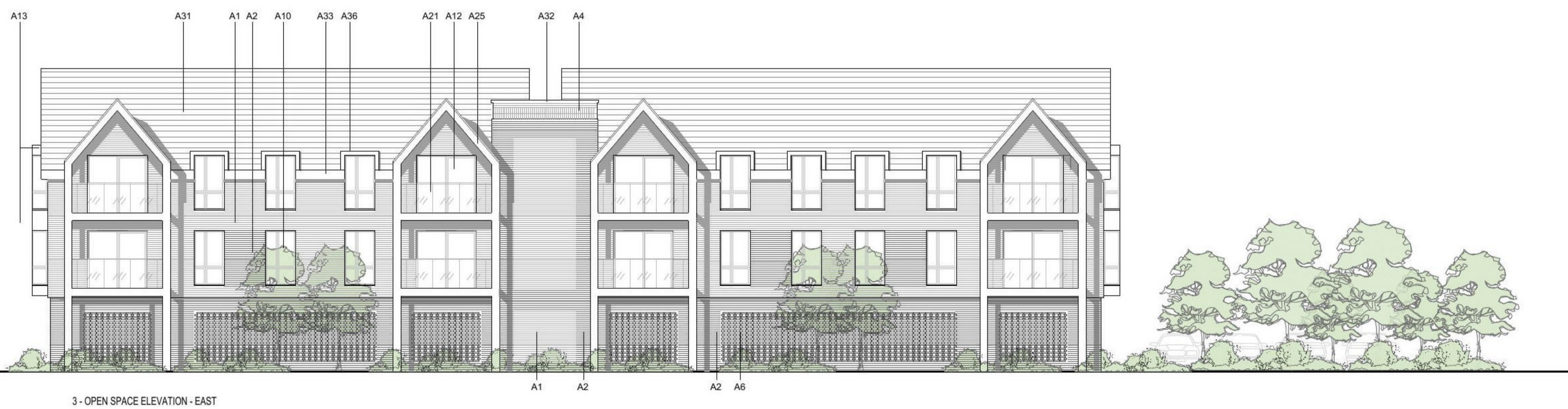
3 - OPEN SPACE ELEVATION - EAST