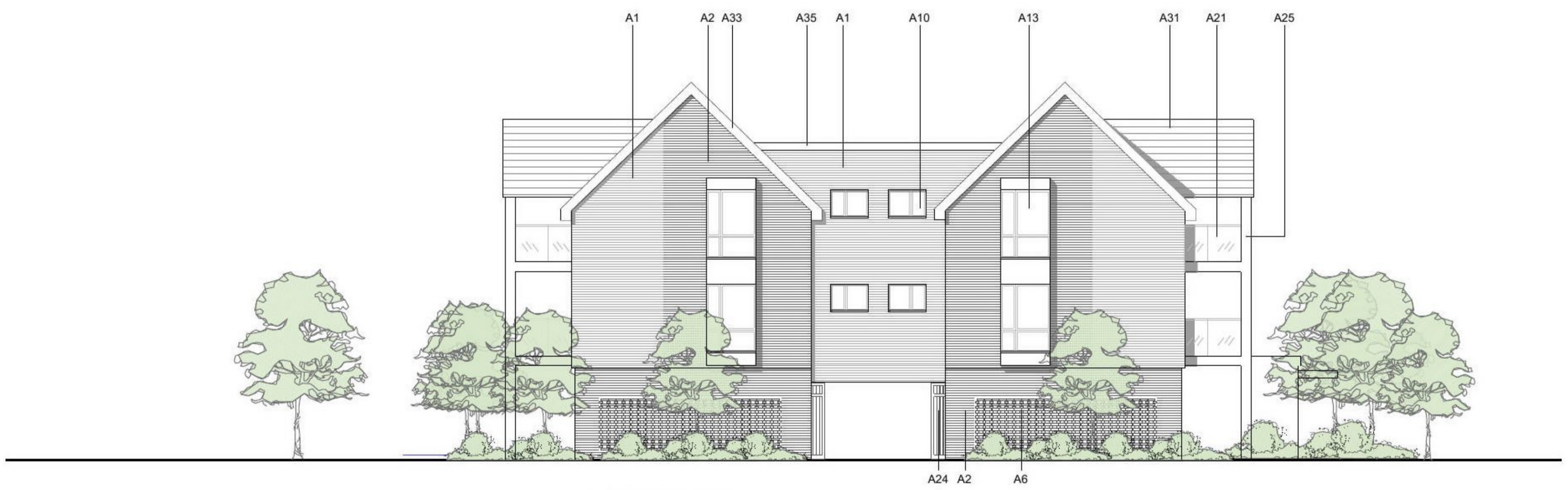
4 - SIDE ELEVATION - SOUTH