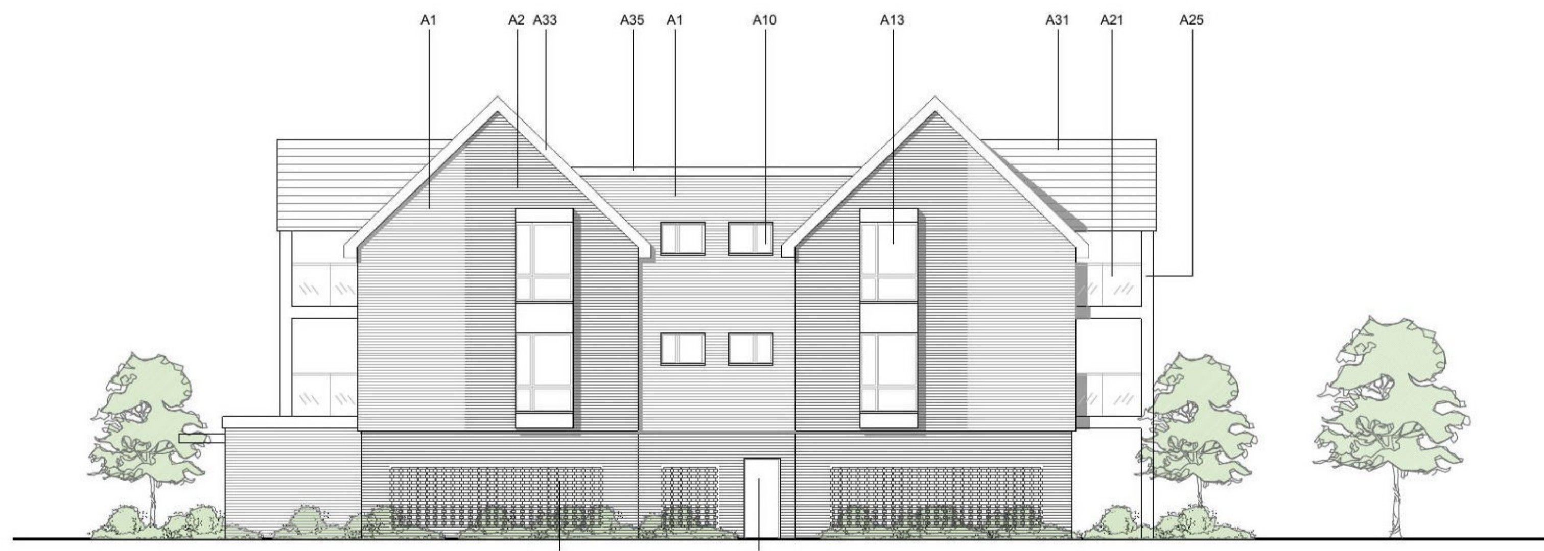
2 - SIDE ELEVATION - NORTH

B - third floor omitted 10.05.21 ch - key plan updated in line with PL-1000 N A - apartment block design revised 3.5.19 dt