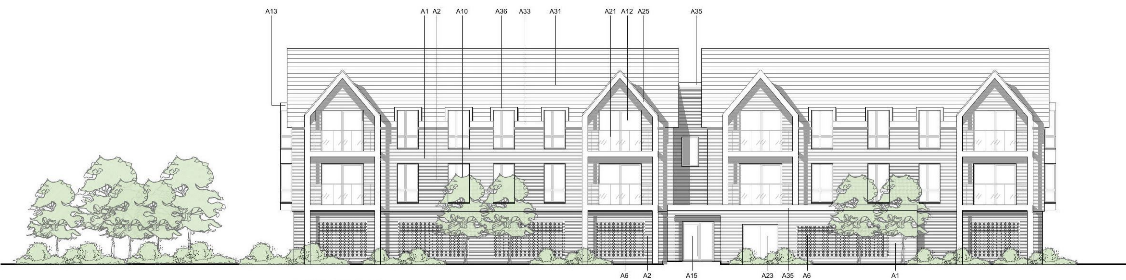
1 - STREET ELEVATION - EAST