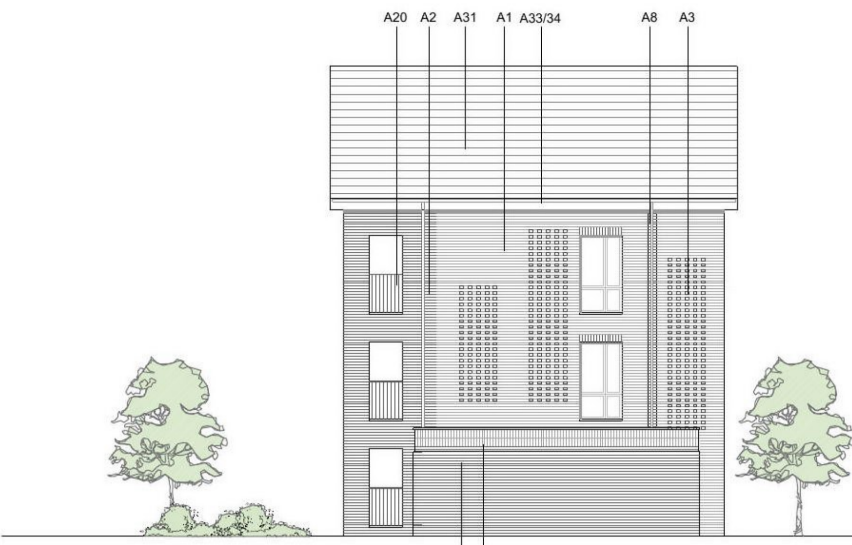
7 - SIDE ELEVATION - SOUTH - BLOCK E