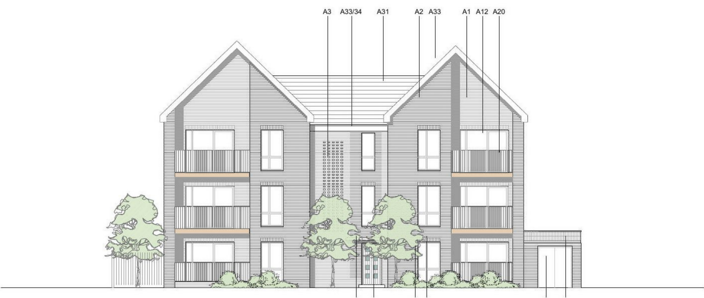
5 - FRONT ELEVATION - WEST - BLOCK E