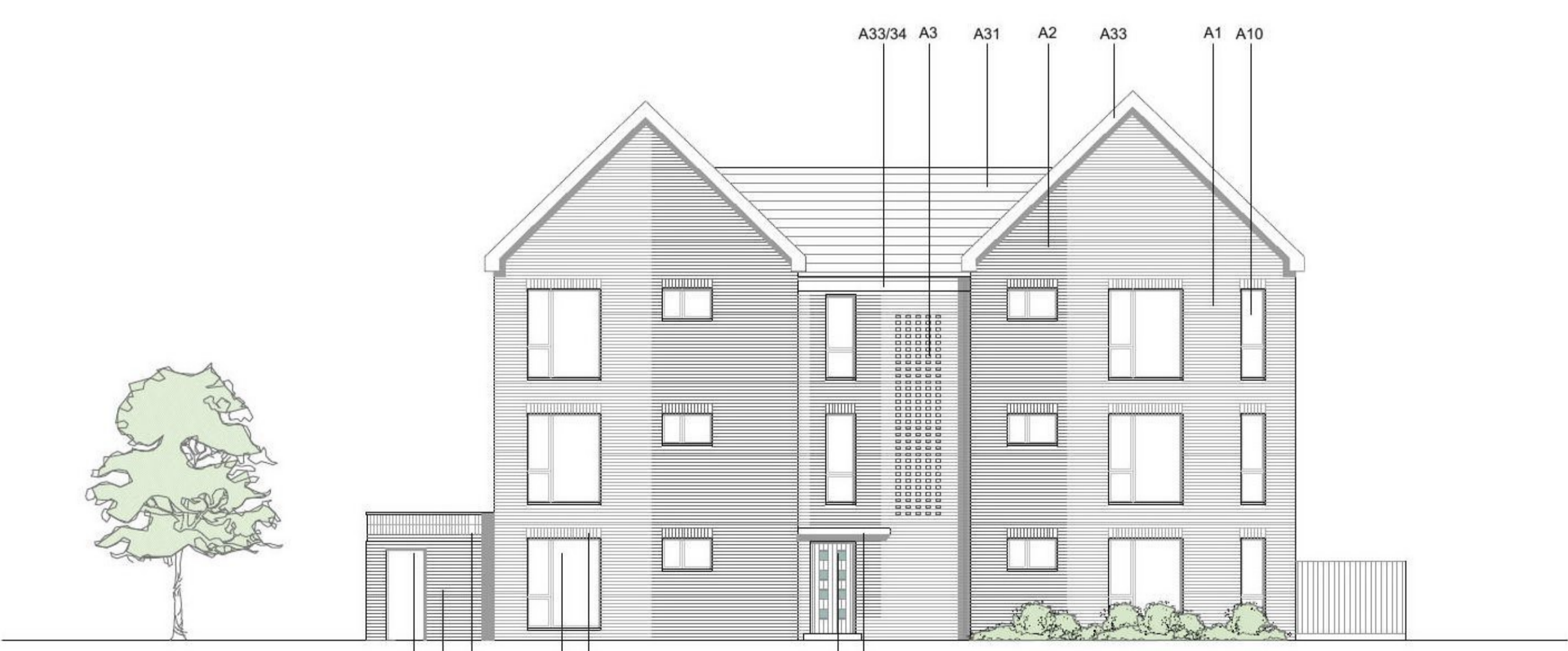
6 - REAR ELEVATION - EAST - BLOCK E

A updated in line with PI 1000 revN 10.5.21 dt