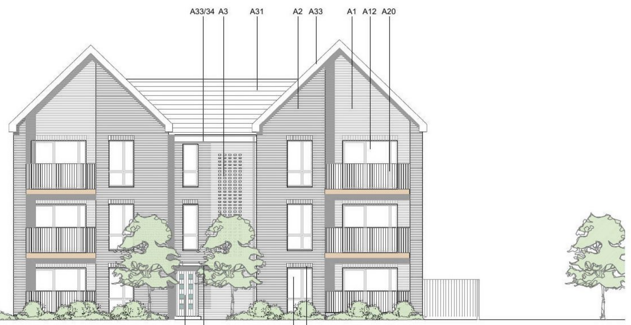
1 - FRONT ELEVATION - SOUTH - BLOCK D