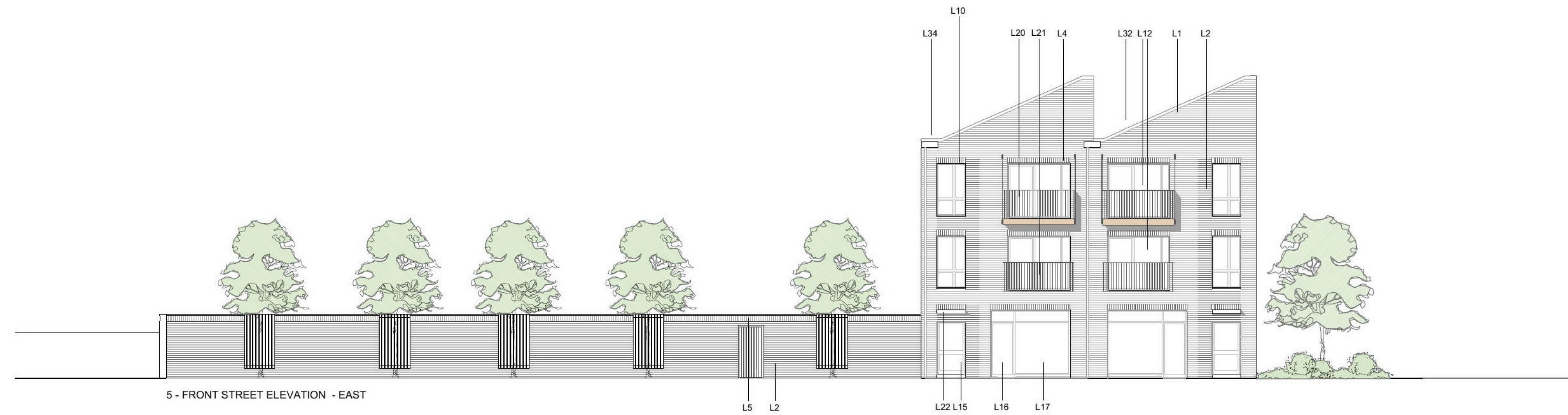
5 - FRONT STREET ELEVATION - EAST