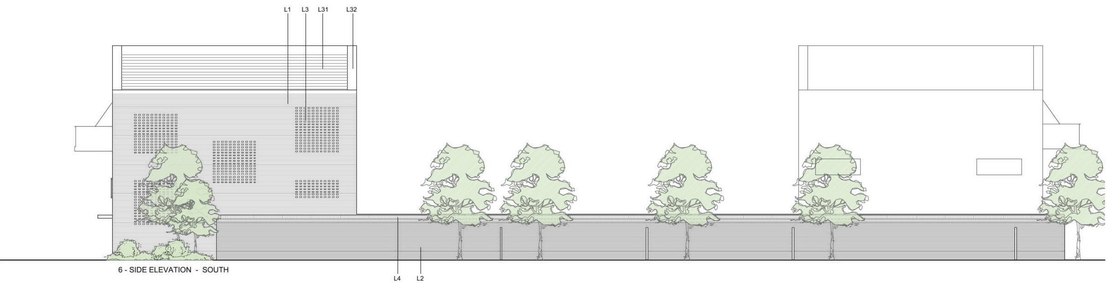
6 - SIDE ELEVATION - SOUTH

B - updated in line with site plan PL 1000 rev N 10.05.21 dt A - east car park wall revised 8.4.19 dt