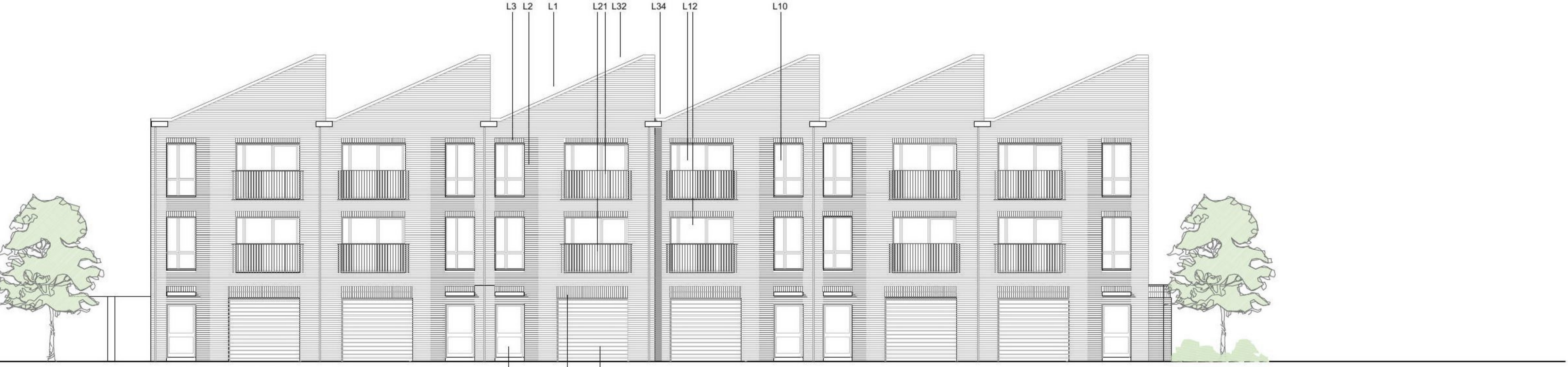
3 - COURTYARD ELEVATION - EAST