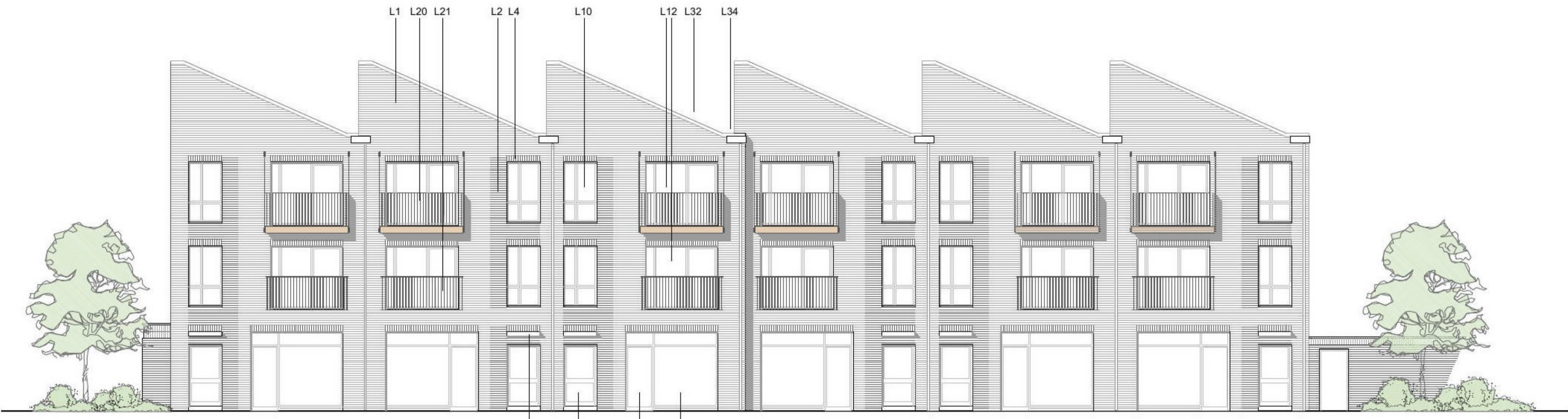
1 - FRONT STREET ELEVATION - WEST