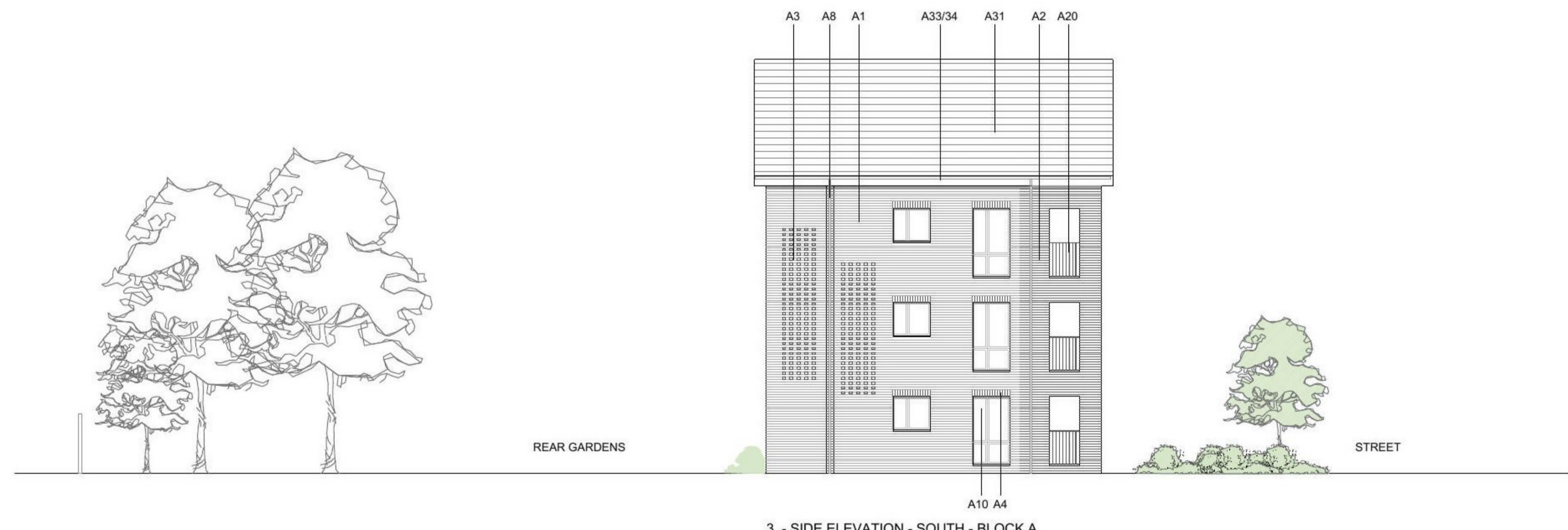
3 - SIDE ELEVATION - SOUTH - BLOCK A