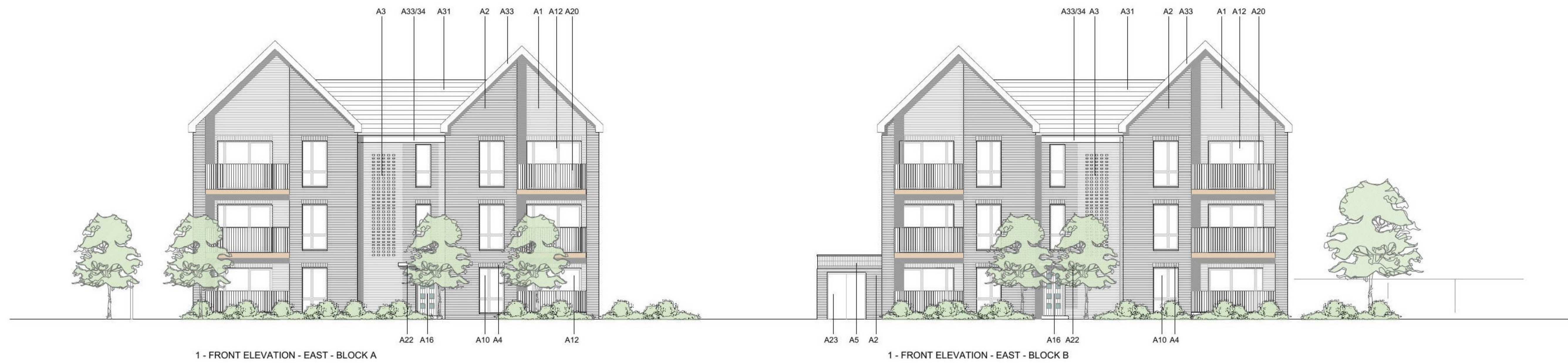
1 - FRONT ELEVATION - EAST - BLOCK A