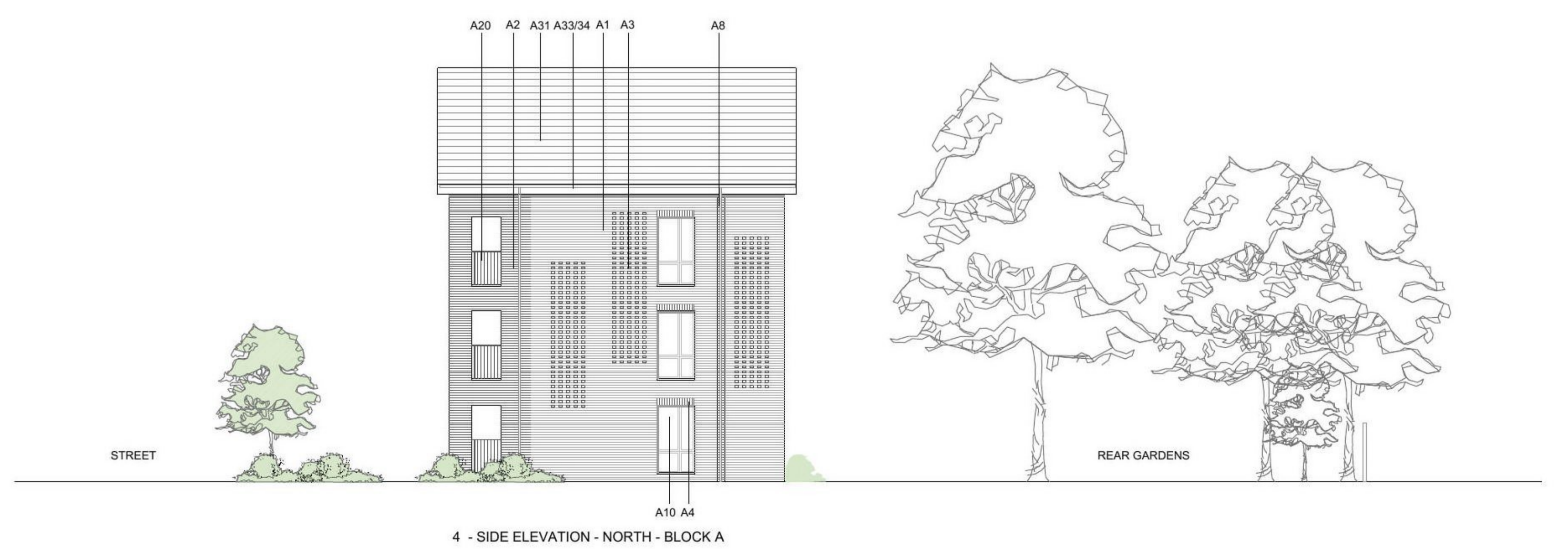
4 - SIDE ELEVATION - NORTH - BLOCK A

B key plan updated in line with PL-1000 N 10.05.21 rh/dt A - site plan updated to PL-1000 Rev L 26.02.21 rh/dt