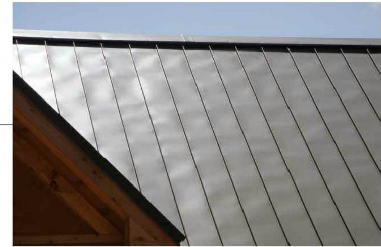
Roof - KingZip IP Standing Seam Insulated panel in Anthracite Grey - Supplied by Kingspan.