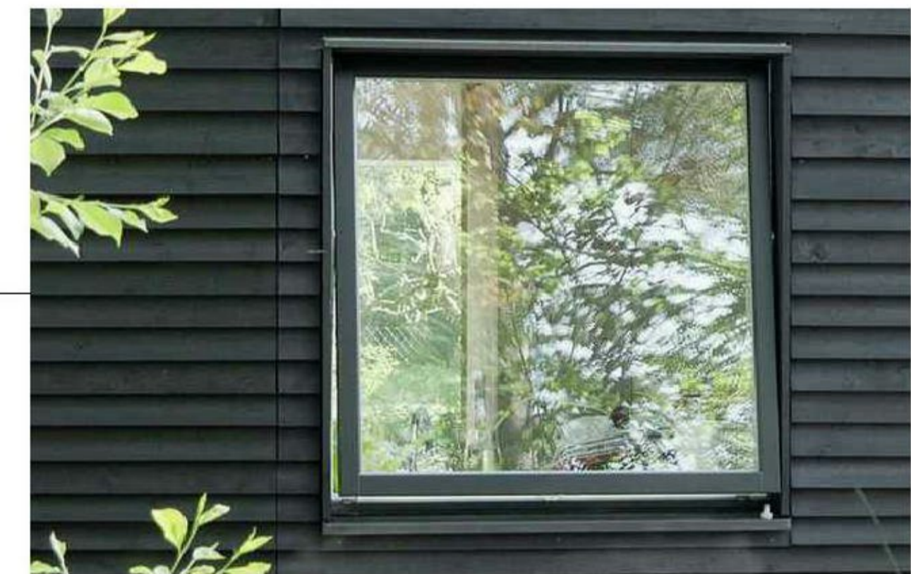
Doors & Windows - Black powder coated aluminum.