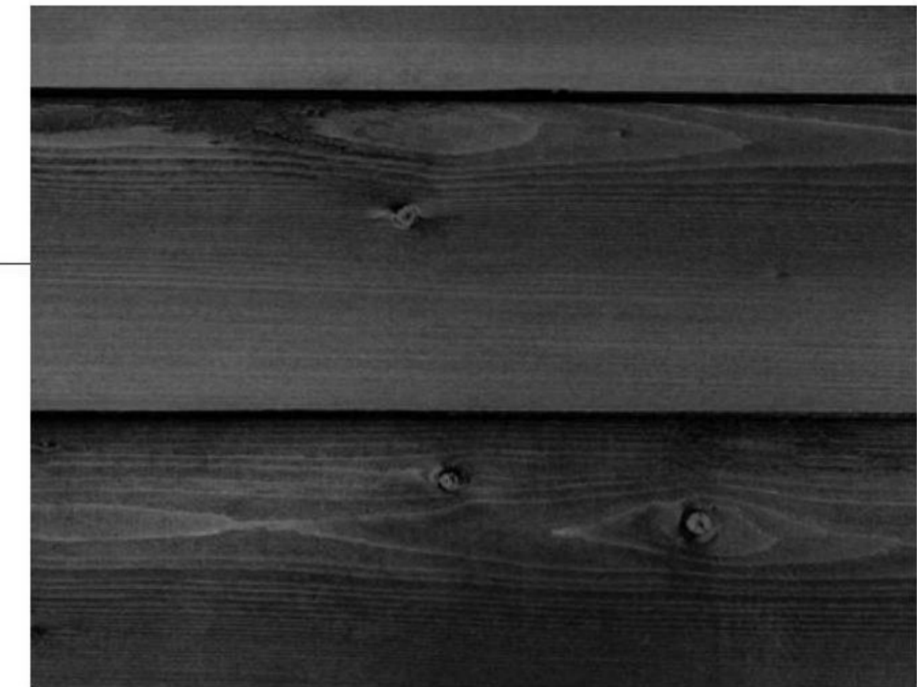
Walls - Clad in Q-clad black weatherboard. Horizontal 24mm feathered edge boards, 145mm wide. Supplied by Chiltem Timber.