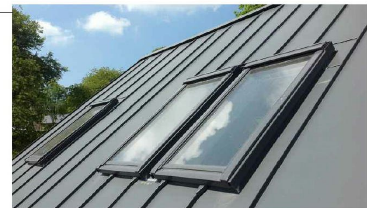
Rooflights - Studio Designer neo supplied by the Rooflight Company.