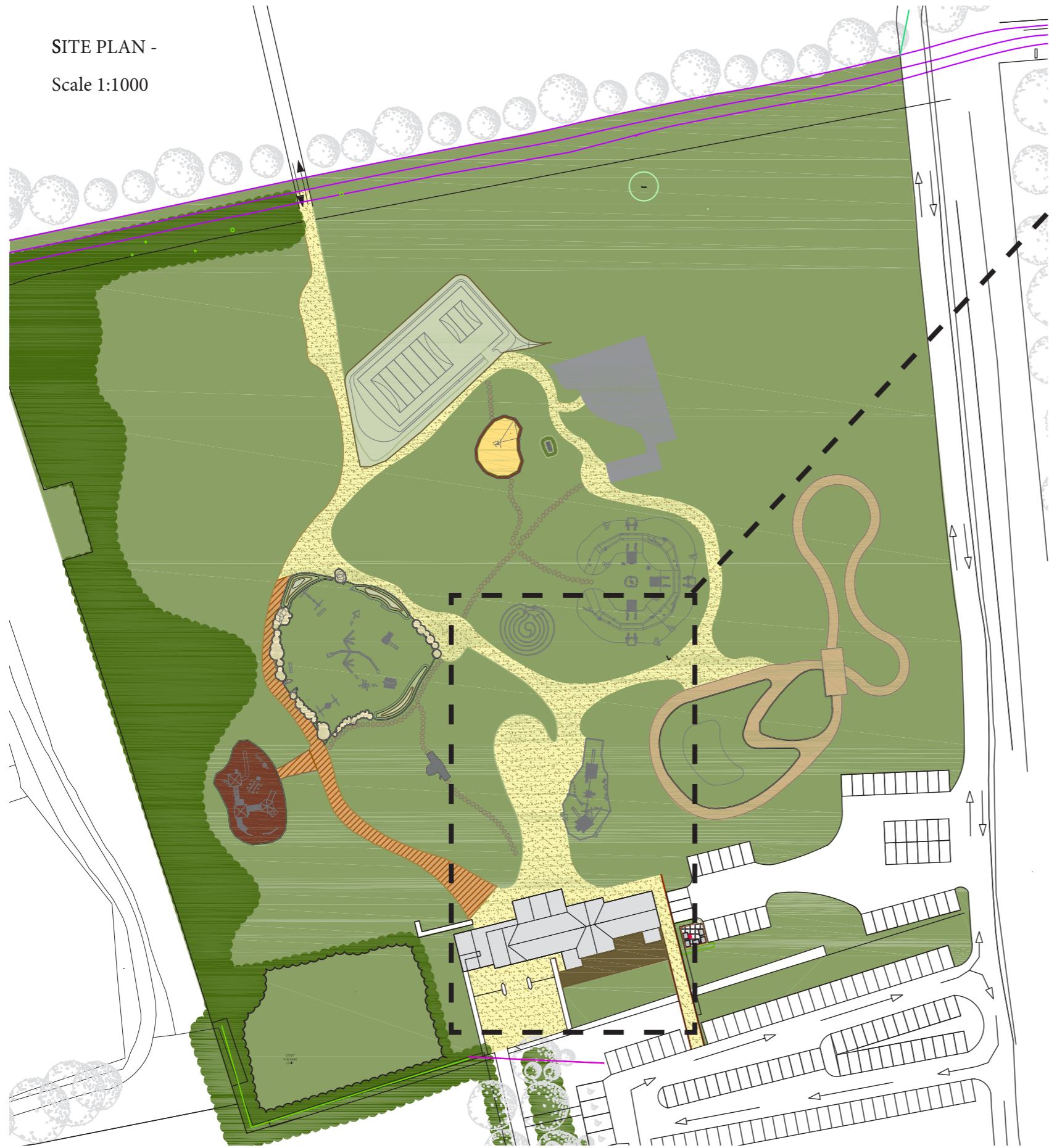
SITE PLAN - Scale 1:1000