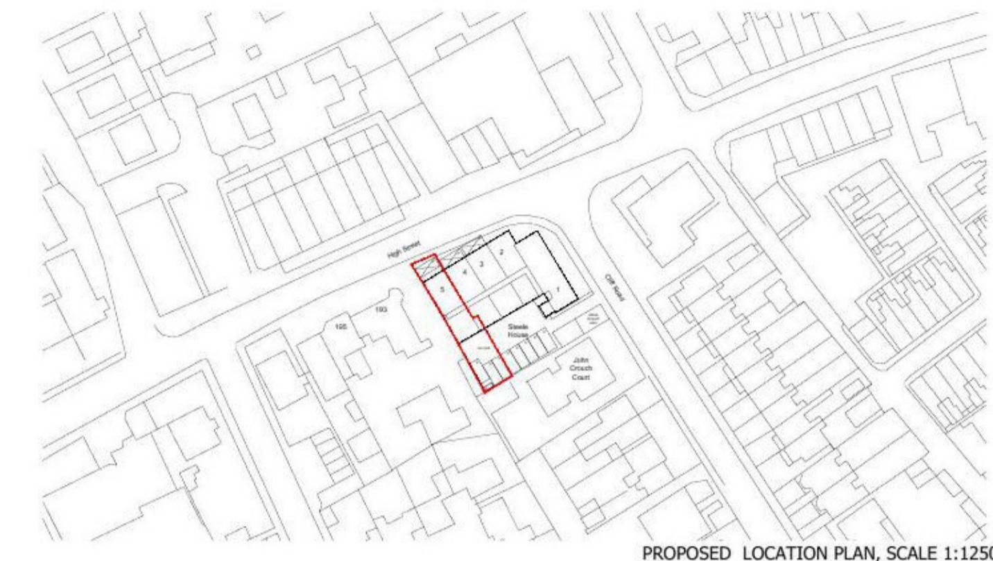
PROPOSED LOCATION PLAN, SCALE 1:1250