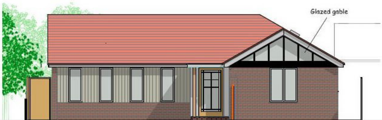
ELEVATION TO GLEBE WAY

This document and its design content is copyright ©. It shall be read in conjunction with all other associated project information including models, specifications, schedules and related consultants documents. Do not scale from documents. All dimensions to be checked on site. Immediately report any discrepancies, errors or omissions on this document to the Originator. If in doubt ASK.