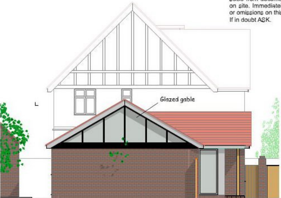
SIDE ELEVATION TO 31 GLEBE WAY