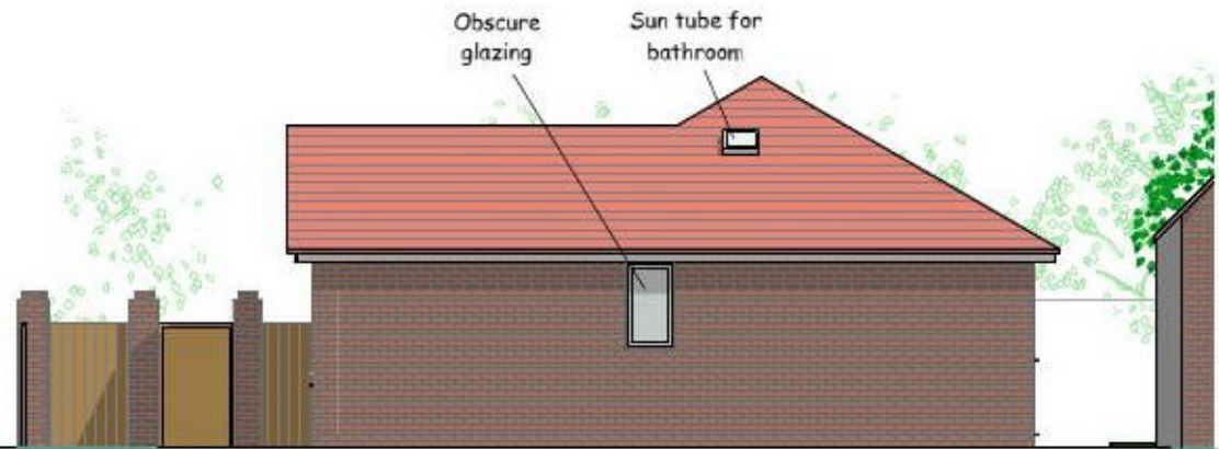
SIDE ELEVATION TO 33 GLEBE WAY