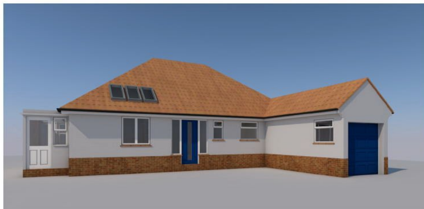
ELEVATION TO AUDLEY WAY

In addition to the hazards/risks normally associated with the types of work detailed on this drawing take note of the above. It is assumed that all works on this drawing will be carried out by a competent contractor working, where appropriate, to an appropriate method statement.