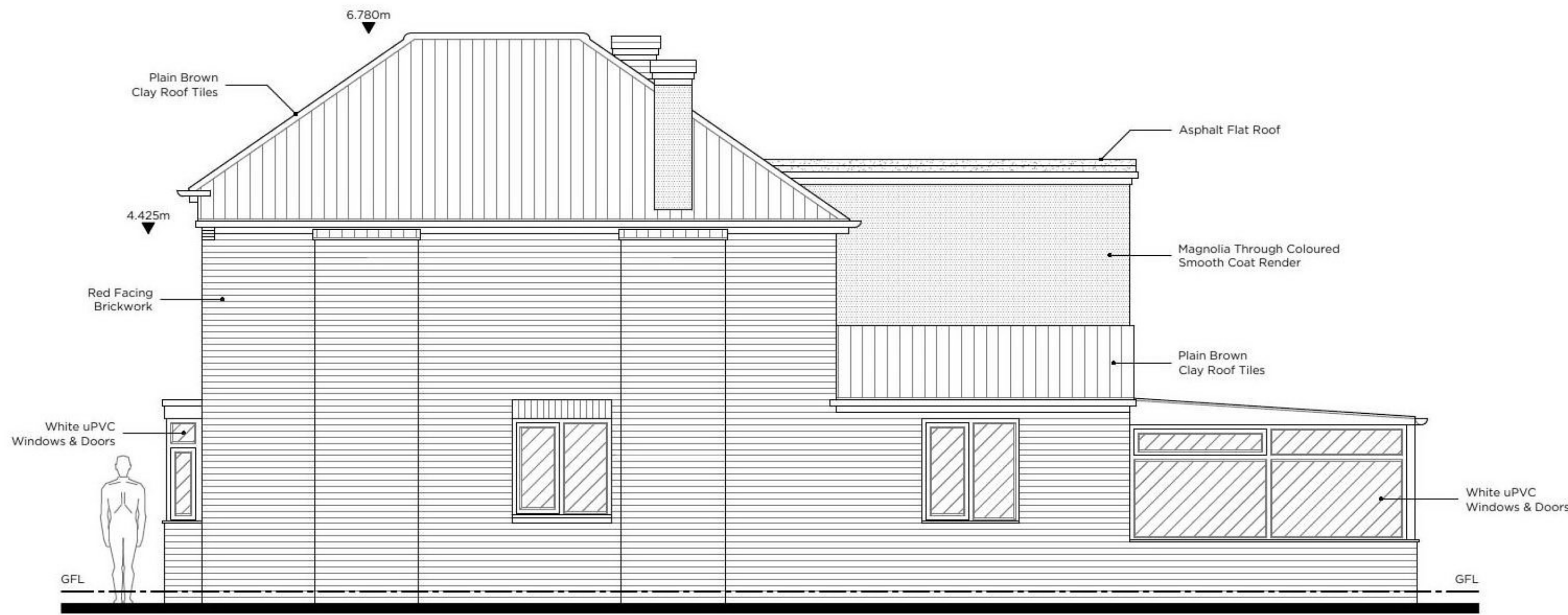
4.4 Existing Side (South East) Elevation Scale 1:50