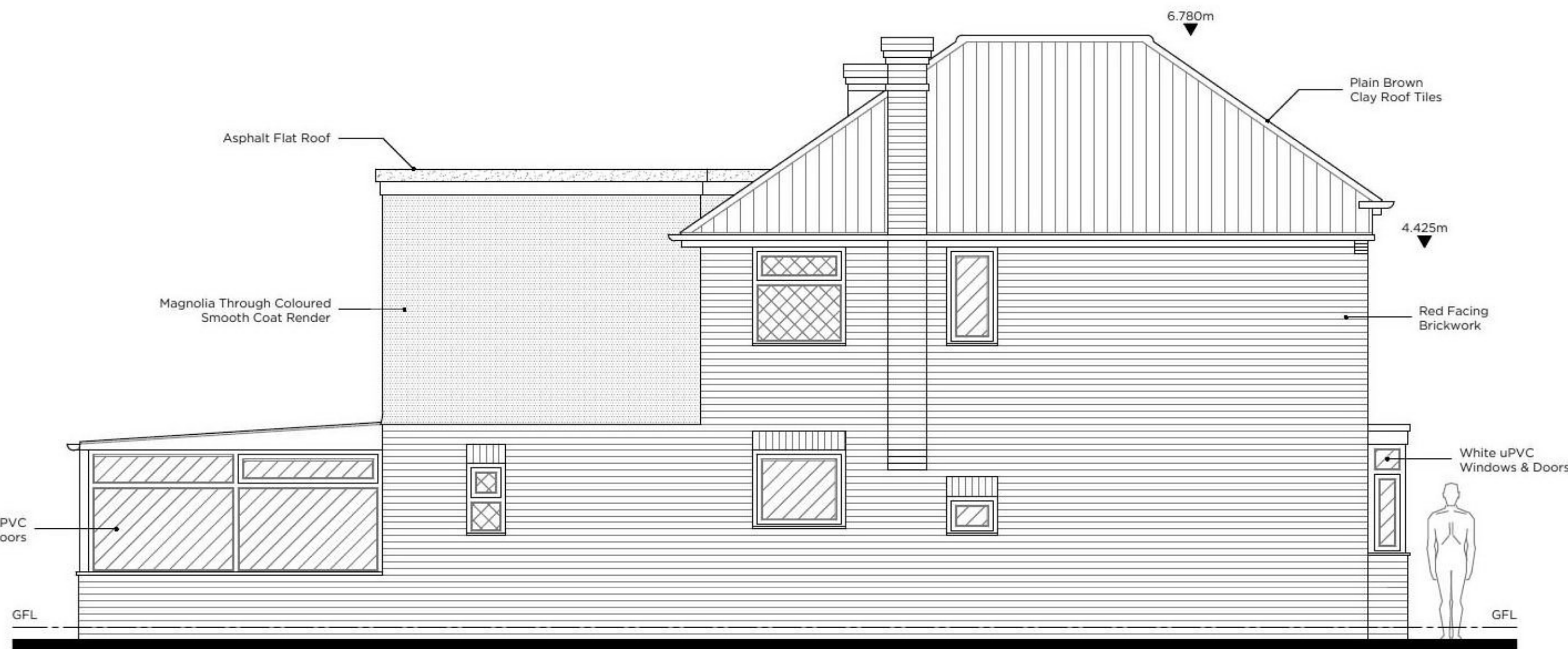
4.2 Existing Side (North West) Elevation Scale 1:50

0m 1m 2m 3m 4m 5m 0.5m 1.5m 2.5m 3.5m 4.5m Scale 1:50 at A1