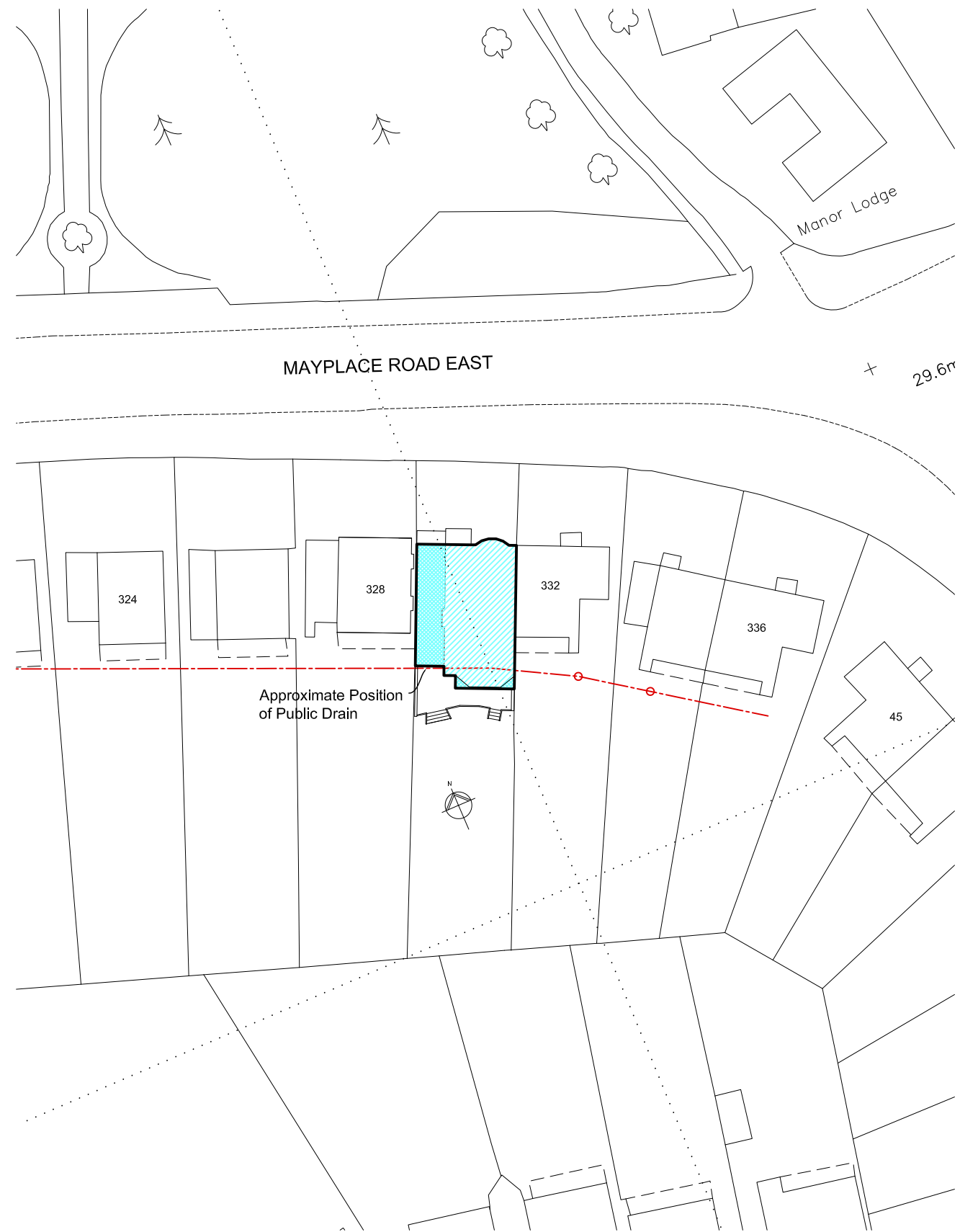
Site Plan 1:500