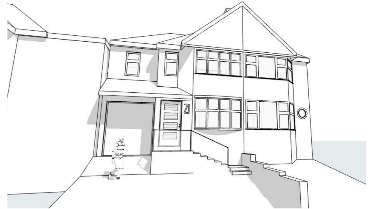
3D Front View - Proposed (NIS)