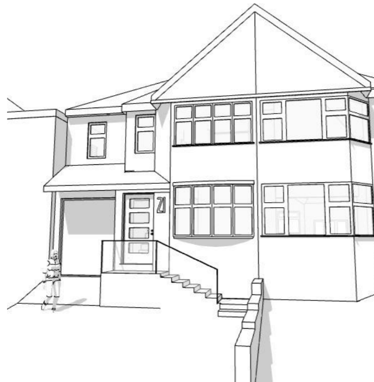
3D Front View - Proposed (NIS)