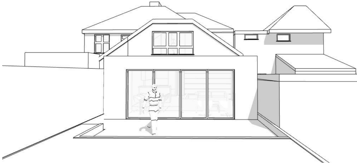
3D Rear View - Proposed (NIS)