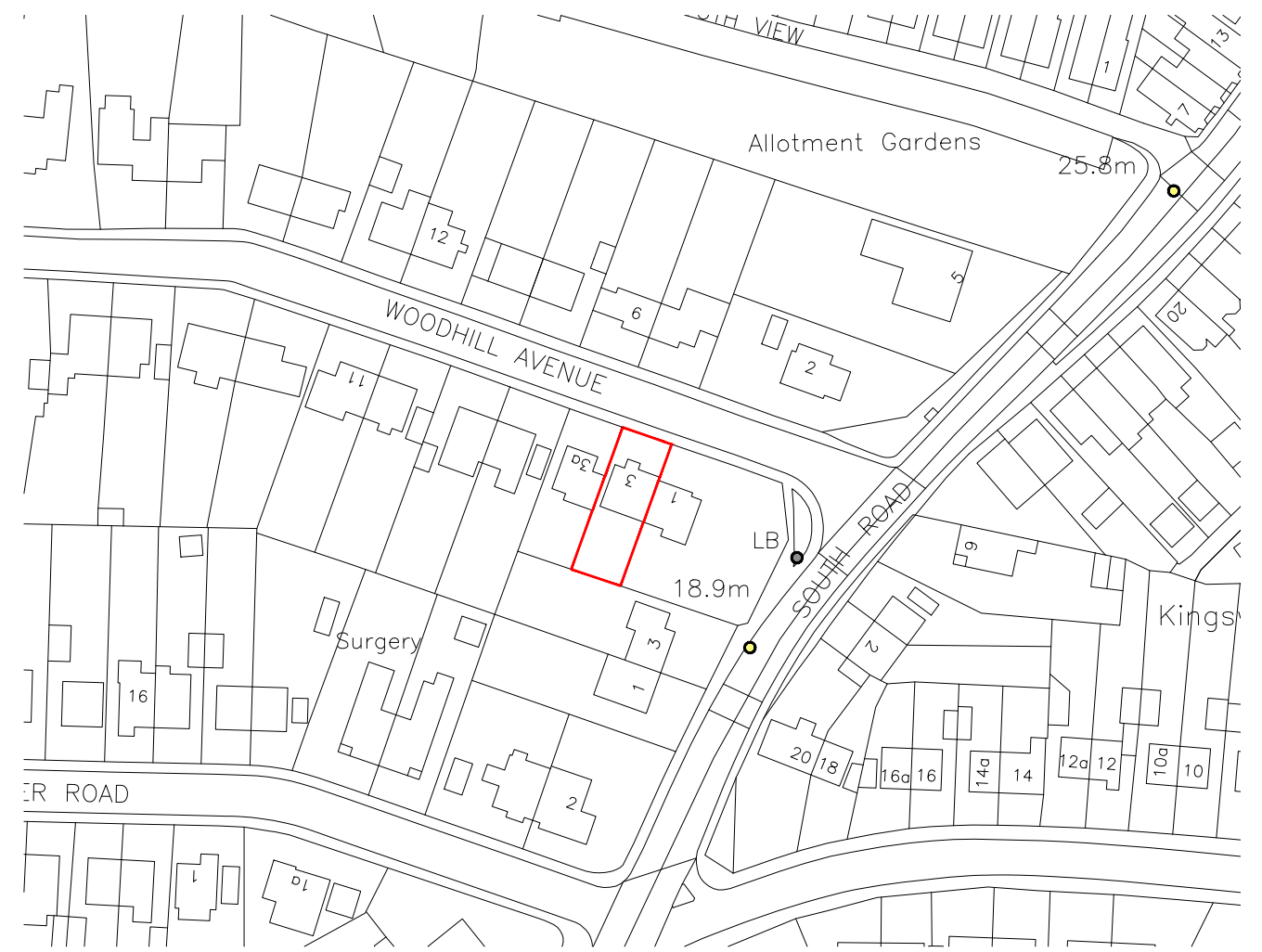
SITE LOCATION PLAN - SCALE 1:1250 @A3