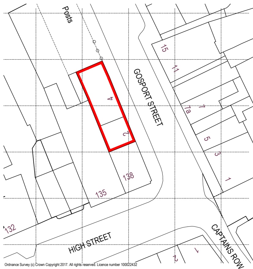
LOCATION PLAN (SCALE 1:500)