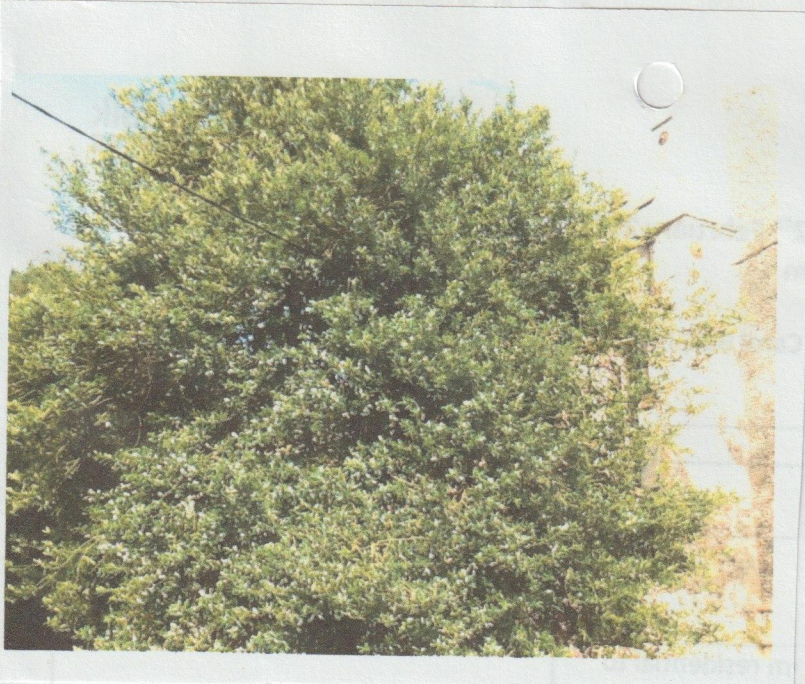
T15 - HOLLY (PRUNE BRANCHES TO GIVE 0.5M CLEARANCE FROM ELECTRICITY CABLE)