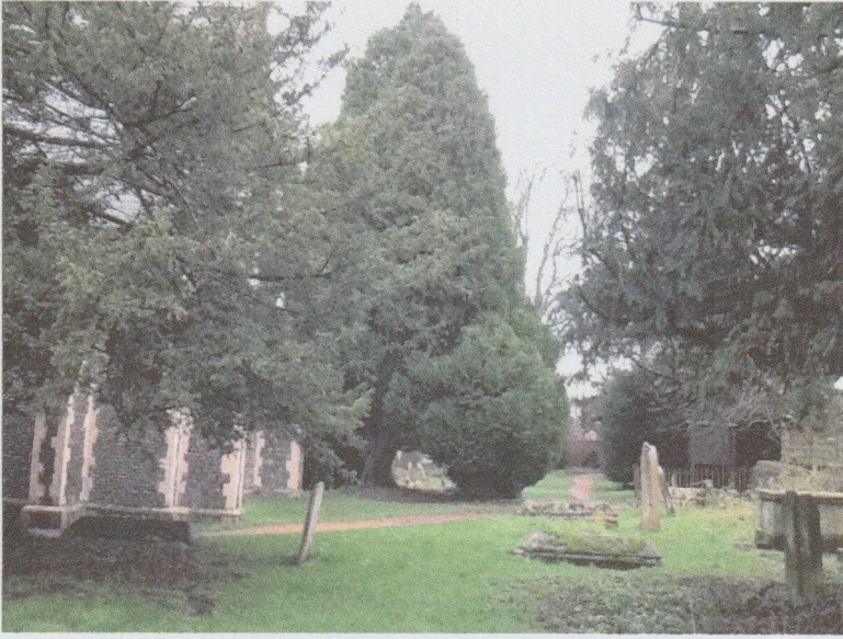
T26 - LEYLANDI (SHOWING BRANCH GROWING OUT LOW TOWARDS FOOTPATH)