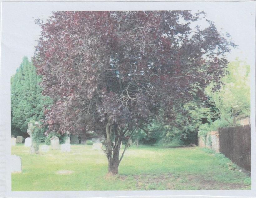
T49 - ORNAMENTAL PLUM

T49 - ORNAMENTAL PLUM (SHOWING SUCKER GROWTH IN INNER CROWN TO BE REMOVED)