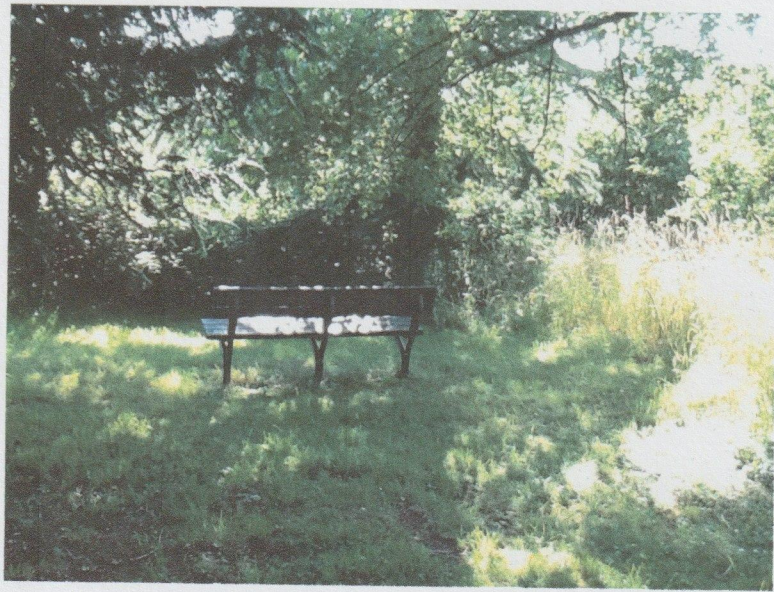
T8 - SPRUCE (SHOWING SEAT)