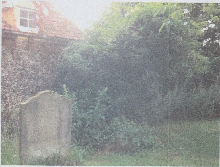
T3 - ELDER (FELL + REMOVE STUMP)