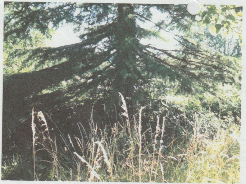
T8 - SPRUCE (FROM SEAT) (CROWN LIFT TO 4M)