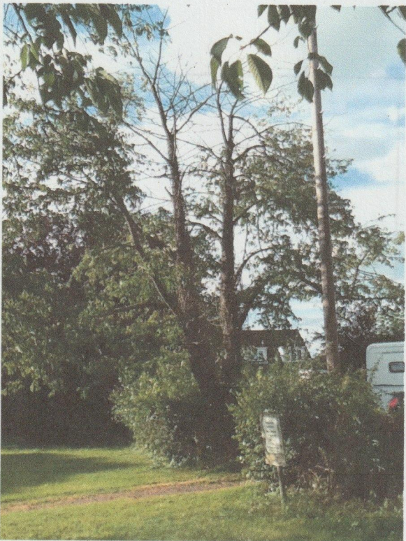
T34 - ORNAMENTAL PLUM (FELL AND REMOVE STUMP)