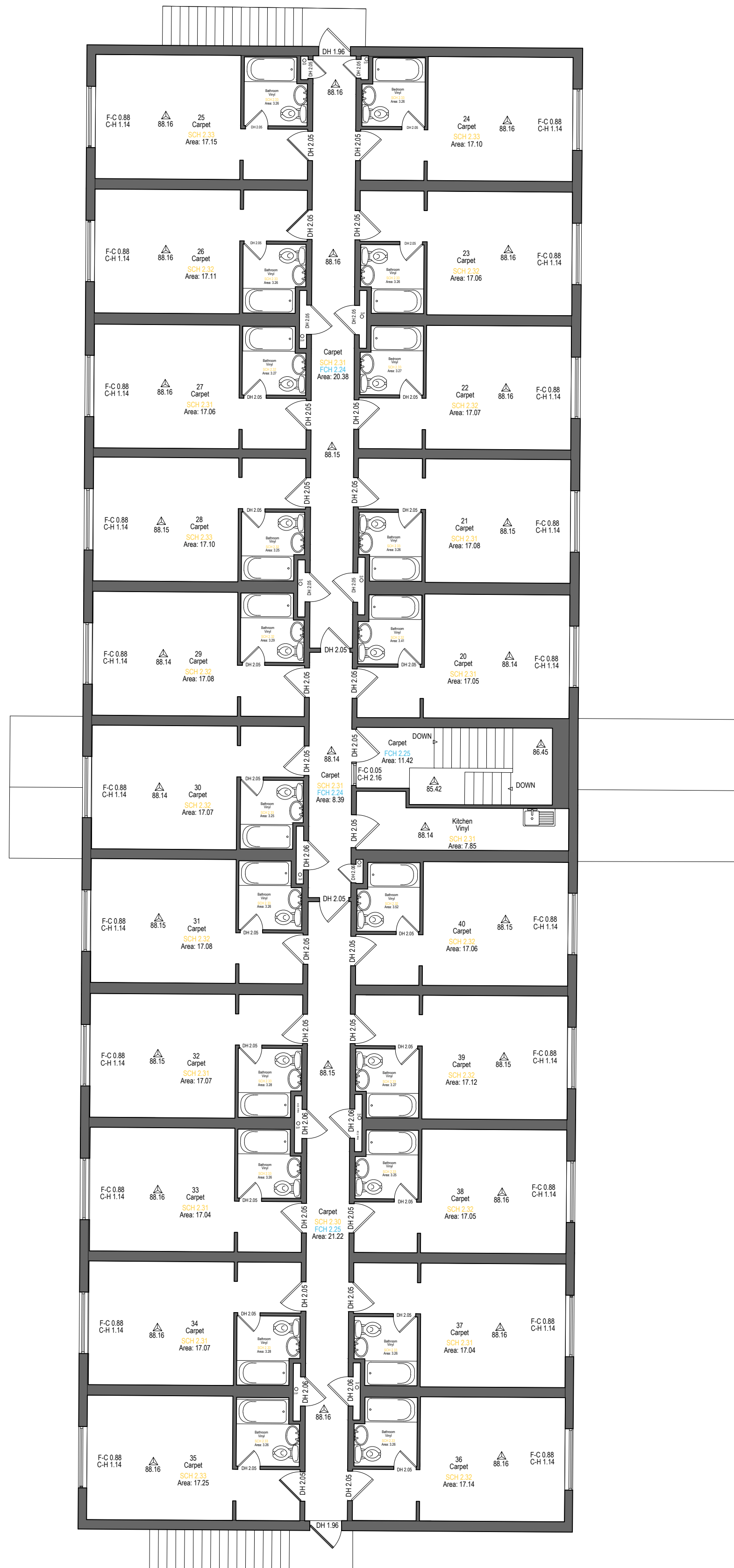
02 FIRST FLOOR PLAN 1:100