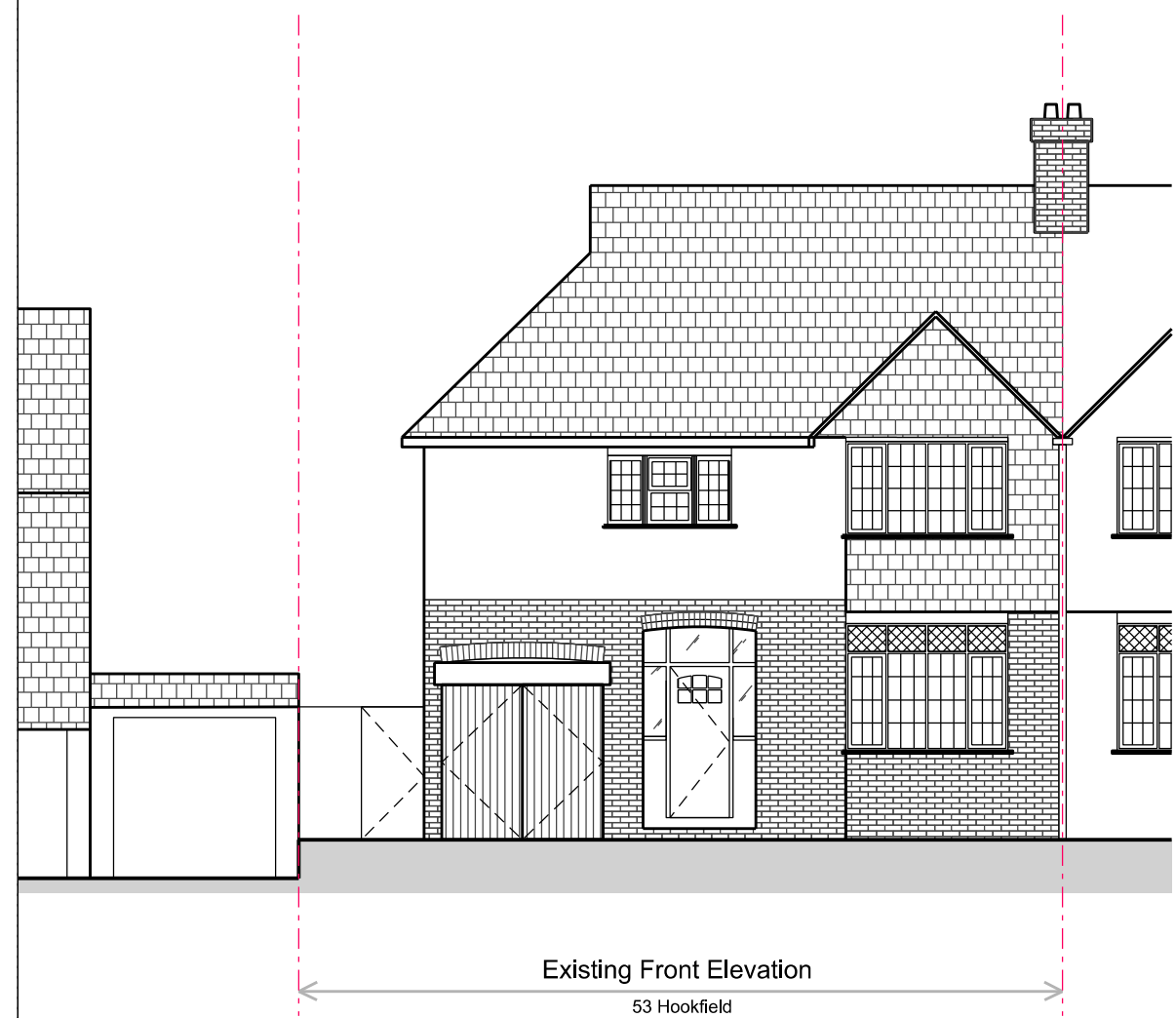
Existing Front Elevation 53 Hookfield