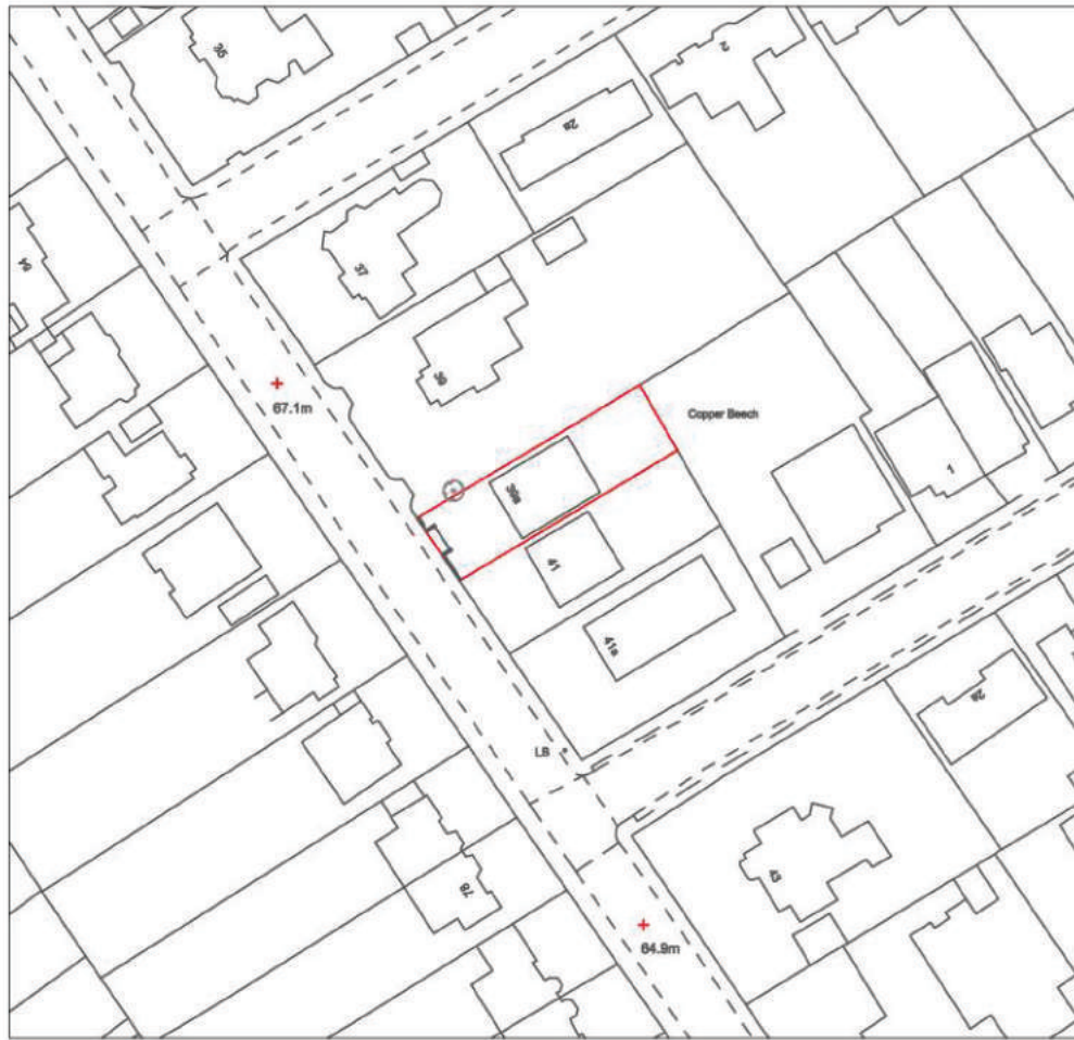
SITE PLAN 1:1250